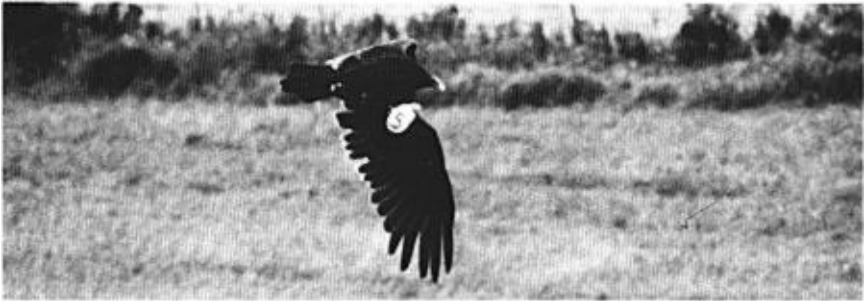
FIGURE 2. Position and readability of marker during flight.

We feel tags should be kept as short as possible in both species, and care should be taken to avoid the turbulent area along the trailing edge of the wing.