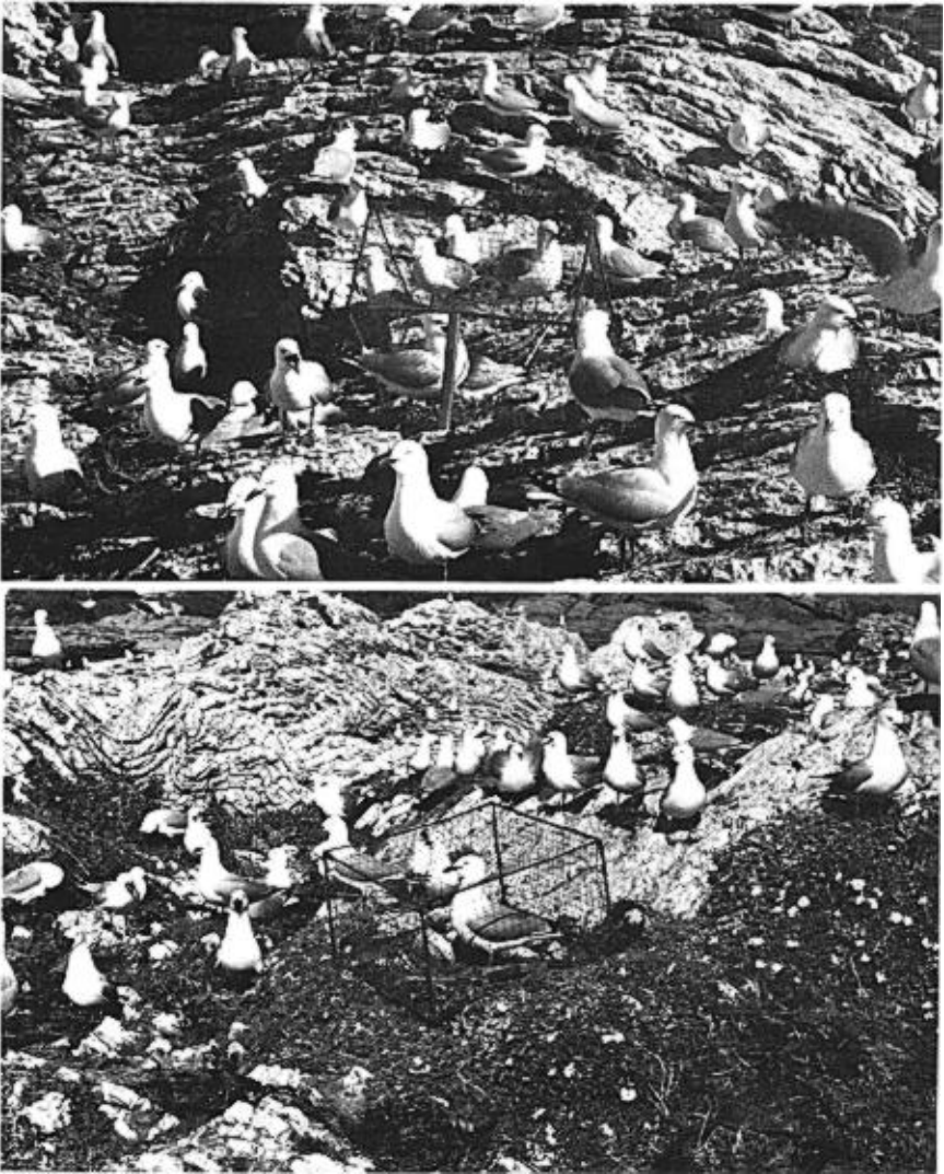
FIGURE 2. (upper) The trap set over a Red-billed Gull nest. (lower) The captured gull is preparing to incubate while confined.

with 3.81-cm taut mesh nylon fish netting. The top has a small hole ( 10 \times 10 cm) in the center of the netting through which the captured bird can be held. The trap is propped open at an angle of about 33^\circ by a split peg (23 cm). A nylon line attached from half way up the lower peg extends to the back of the base. The dimensions shown in Figure 1 are suitable for use where nest spacing is 60 cm.