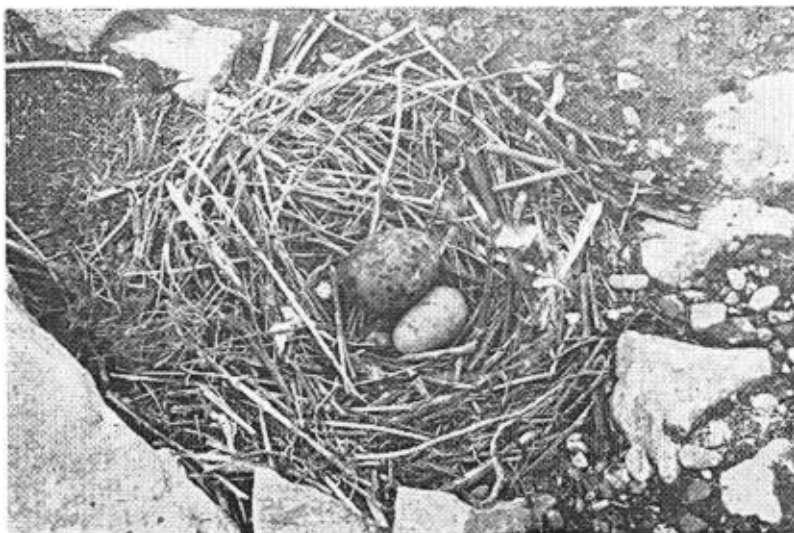
FIGURE 2. Close-up of the reconstructed nest containing one of the original two eggs and a smooth egg-shaped rock.

In a Ring-billed Gull breeding colony where nest density is high, apparently egg-rolling behavior would be favored over the construction of a new nest, because in most cases a distance greater than 30 cm from the original nest would locate the eggs in the nest territory of another pair of adults. However, the nest that we observed, although in an area of high density, was located next to a nest territory that had been deserted earlier in the season. Therefore, when the eggs were displaced, the adults did not have to compete with another adult pair for the new nest site.—FRANCESCA J. CUTHBERT and WILLIAM E. SOUTHERN, Department of Biological Sciences, Northern Illinois University, DeKalb, Illinois 60115 . Received 7 March 1973, accepted 20 March 1973.