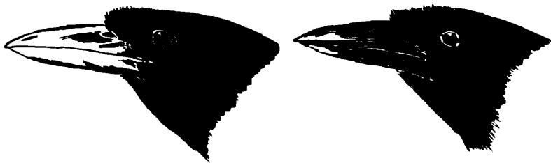
FIGURE 4. Schematic drawing of heads of two specimens of Cyanocorax beecheii , showing progress of blackening of bill in second-year stage from October (left) to May (right).

Second prebasic molt stage. —One specimen (MLZ 11714) taken 31 August is in heavy molt and is acquiring the particolored bill.