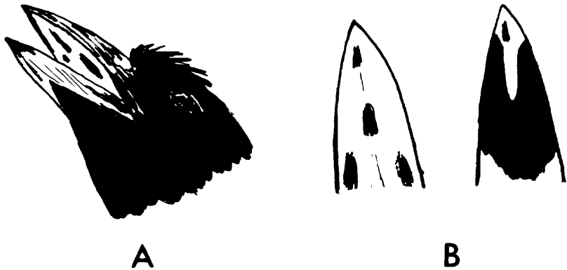
FIGURE 3. A. Schematic drawing of the head of a subadult Cyanocorax sanblasiana nelsoni , showing outwardly particolored bill and largely white interior marked with isolated patches of black. The bill becomes black inside and out in the adult. B. Inside of bill of third-year stage subadult C. yucatanica showing progress in blackening of inside of upper mandible from 27 November (left) to 8 May (right).

First prebasic molt stage. —One specimen, dated 12 August (MLZ 30877). Only body feathers involved, mantle becoming purplish-blue, and head, nape and underparts black. Molt of body feathers proceeding from head posteriorly. No changes in color of bill, tarsi, or toes.