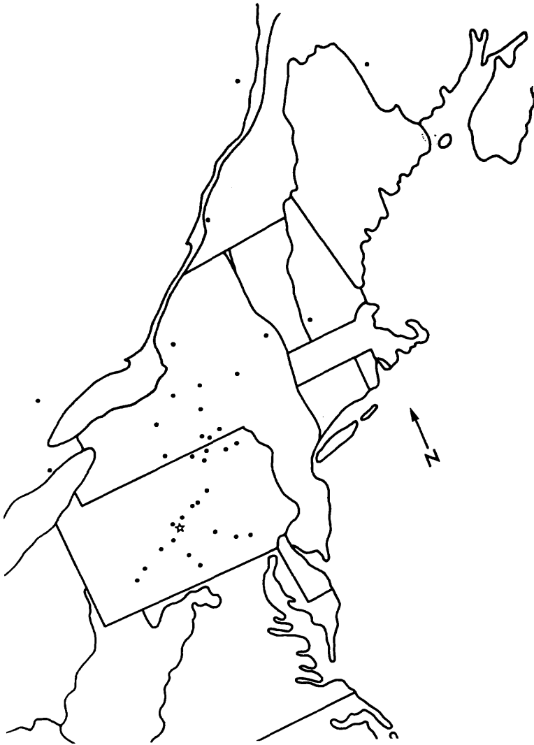
Figure 3. Locations of recoveries in the breeding season of birds banded at State College, Pennsylvania.