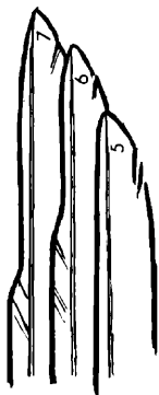
Sixth Primary Cut Out as in most E. minimus and some E. flaviventris