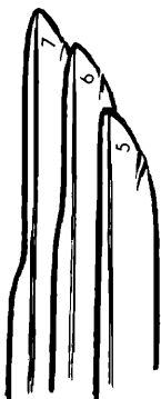
Sixth Primary Slightly Cut Out as in some E. minimus and some E. flaviventris