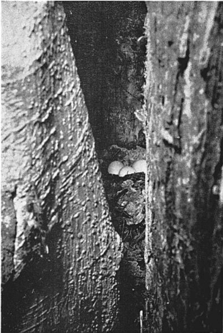
Nest of Ivory-billed Woodhewer in cavity between cypress trunk and 'root' of strangling fig, Río Sabinas, southern Tamaulipas, May 28, 1947.