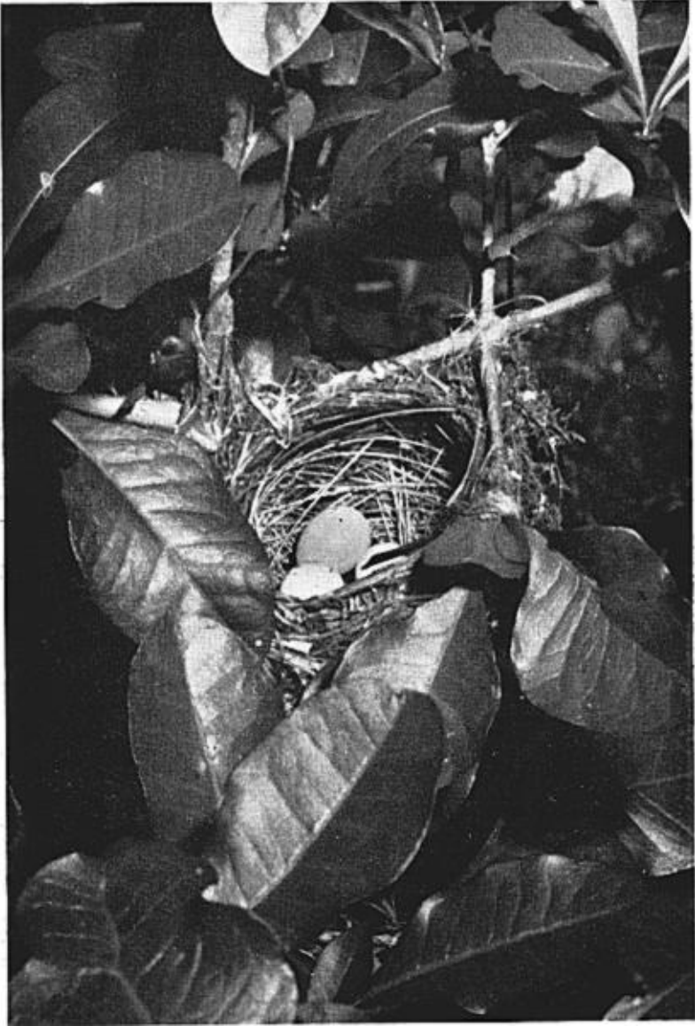
Nest of Yellow-green Vireo in sapling Randia along the Río Sabinas, in southern Tamaulipas, May 28, 1947.