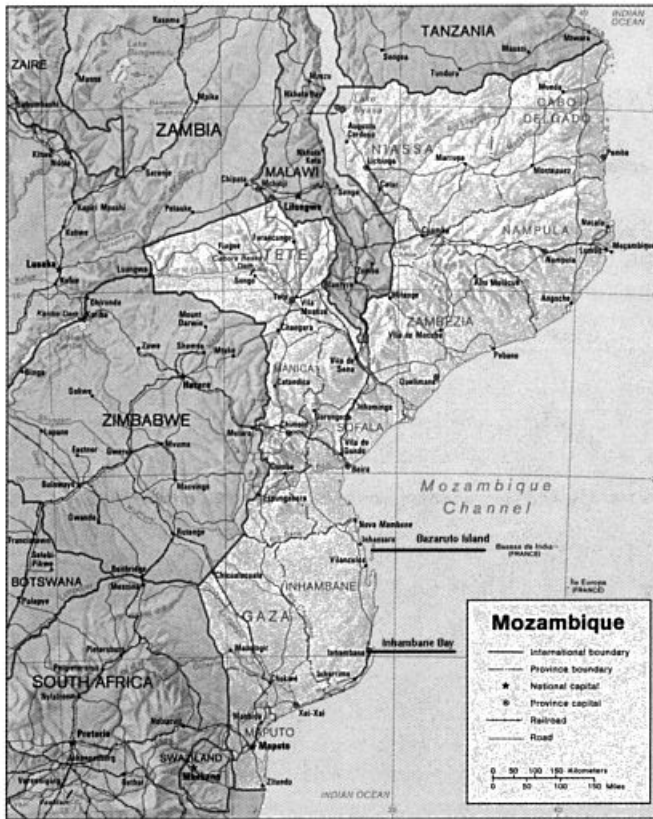
Figure 1 left – Map of Mozambique showing the location of Inhambane Bay and Bazaruto Island. (picture obtained at www.sdn.org.moz )