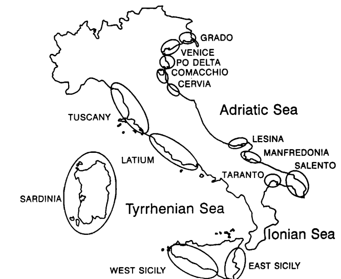
Figure 1. Map of Italy showing the different counted areas.

GRADO: Lagoon of Grado-Marano (ca. 17,000 ha), Isonzo mouth and northernmost Adriatic seashores, with offshore sandbanks. Average spring tide range: 90 cm. The area includes two Ramsar sites (total 1 650 ha) and some no-shooting sites. Data given is from 1991 (Baccetti et al. 1992), 1994, 1995 and 1996. Counts were made by 'Osservatori Faunistici' of Friuli - Venezia Giulia.