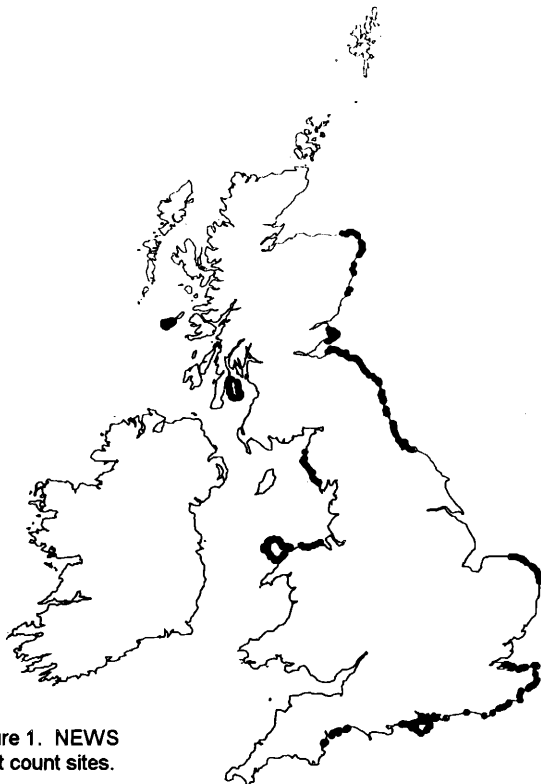
Figure 1. NEWS pilot count sites.

Ringed Plover, Turnstone, Sanderling and Purple Sandpiper are the only species considered here as previous work has shown that the non-estuarine coastline supports a major proportion of the population of these species (Browne et al. 1995; Cayford & Waters 1996). Comparisons were made between data obtained for the intertidal area during the NEWS pilot study and that obtained for the corresponding count sections during the WSC. Paired t-tests were used to compare the residuals obtained when the WSC counts were subtracted from the NEWS pilot counts for each section under the null hypothesis that the mean difference between the two surveys was zero. The residuals were normally distributed.