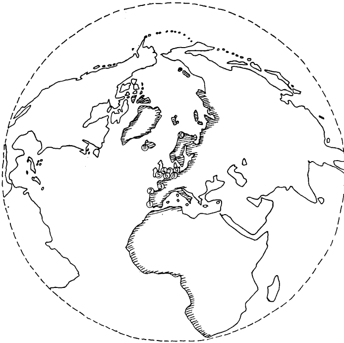
Figure 1. Location of the main projects contributing to the WSG Spring Migration Project during spring 1986. Numbers refer to the list of local organisers.

1986, and some comments about the other sites for which we would particularly like help with the project. We would like to hear from anyone who could participate by counting Knots and/or watching for marked birds. We would like to hear especially from anyone who may be catching Knots during late winter and spring 1986: the Durham/Tromso study caught and ringed (with Stavanger rings) over 1700 Nearctic Knots in Norway in May 1985. We are anxious to discover as much as possible about the subsequent locations of these birds. In particular we would like any information on the measurements and weight of Knots with Stavanger rings, and the identity of other Knots caught at the same time. This information is of course additional to that which we plan to collect by ringing and dye-marking Knots in 1986.