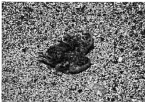
FIGURE 2. Chicks of Least Tern from the 1992 nesting season at Cuixmala beach.

Nesting probably occurs only because Cuixmala Beach is protected. All races of California Least Tern have evolved an ability to rapidly colonize new and appropriate nesting areas. The discovery of this additional nesting site adds new opportunities to the preservation of the most endangered of the Least Tern subspecies.