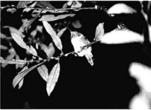
FIGURE 1. Torpid immature male Rufous Hummingbird. This individual's body mass was 60% above lean body weight just before he roosted and entered torpor. He resumed migration at dawn the next day.

in the cold dry winter than in the warmer wet summer when more flowers and insects were available (Carpenter 1974). However, the energy state of the birds in these two studies was unknown.