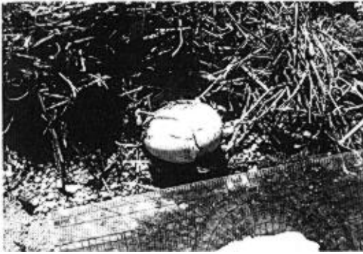
FIGURE 2. Cracked egg and thin mat of dried grass taken from slightly enlarged terminal chamber of burrow.

of the top of the roadcut (Aguacerales; n = 285 , \bar{x} = 0.5 \pm 0.3 m, range = 0.05–2.3 m); three to six alternating layers of pumice and paleosol wide enough for burrow excavation occur in this section. The average height of burrows above the foot of the roadcut was 2.3 \pm 1.2 m (Aguacerales; n = 285 , range = 0.8–10.0 m). In many places tussock grass overhangs the bank edge above the burrow entrances providing some degree of protection from rain. Because of the steepness of the roadcuts (usually greater than 70^\circ ), burrows are somewhat inaccessible to terrestrial predators. We suspect that the consistent selection of the upper quartile of the roadcut for burrow excavation is influenced by both factors. We noted only two burrows excavated on natural slopes or cliffs away from roadcuts. This suggests that a limited amount of road building may actually be beneficial to this species. At Aguacerales, the minimum horizontal distance between burrows was 0.65 m. There was no vertical overlap (i.e., one directly above another) of burrows in either locality. We speculate that the greater usage of denser paleosols at Aguacerales may be due to the saturation of "prime" pumiceous strata with old burrows. Patterns of soil stratification did not appear to differ grossly between the two sites.