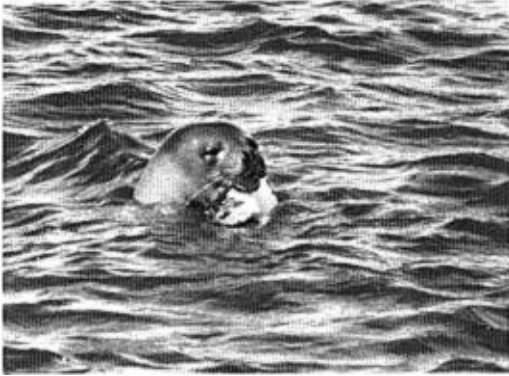
FIGURE 1. Weddell seal with Chinstrap Penguin.