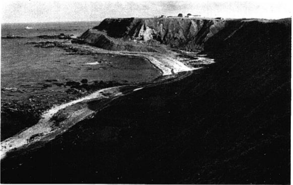
FIGURE 2. North Beach bluffs, Shemya Island, looking east, 2 October 1977.

menius phaeopus variegatus , Leucosticte arctoa griseonucha ) and others that are presumptive assignments based on range. Most are, as well, inferences based on specimens of these forms taken elsewhere in the Aleutian Islands. Only one of the presumptive subspecies allocations implies occurrence of a form not substantiated by specimen in Alaska—the occurrence of Podiceps a. auritus is inferred from timing of, and western Bering Sea origin of weather systems preceding, the birds' arrivals.