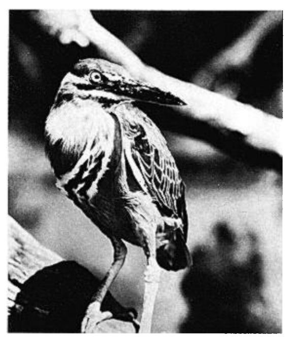
FIGURE 2. Striated Heron ( Butorides striatus ) at Punta Espinosa, Fernandina, July 1971.

For many years it was not realized that there were two species of Butorides , B. striatus and B. virescens , on Cocos Island and it is still not certain which breeds or whether both are resident (Slud 1967). The taxonomy of the group obviously needs some critical attention.