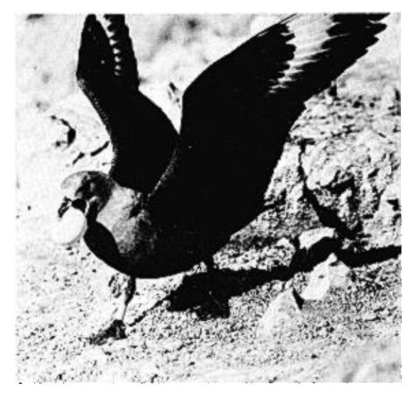
FIGURE 1. South Polar Skua carrying away an Adélie Penguin egg. This is done when other Skuas are competing for the egg.

In the Adélie Penguin rookery at Cape Crozier, South Polar Skuas nest only around the landward periphery, but not within the rookery or near the beach. They defend feeding territories along that periphery. However, Skuas prey and scavenge throughout the exten-