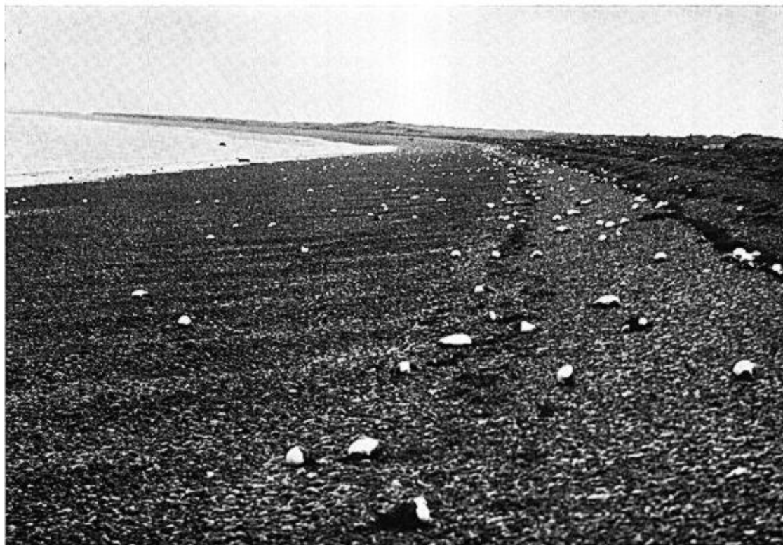
FIGURE 2. Over 3400 dead murren per mile accumulated on beaches at Harbor Point in Port Moller Bay.

unable to assess the degree of mortality west of Unimak Island. Murren are common around Adak Island, but no dead ones were reported by Navy personnel.