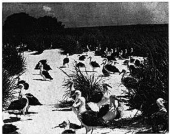
FIGURE 3. The move to Lisianski Atoll in Experiment No. 3: upper, the barge; middle, the young Laysan Albatrosses in the barge; lower, after release on the beach of Lisianski.

Experiment No. 3. The experiment was originally intended to test the return to the natal colony of fledglings moved a long distance and without access to visual cues. However, hot weather made some changes necessary, as is indicated below.