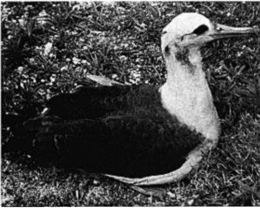
FIGURE 2. A fledgling Laysan Albatross typical of those translocated.

chosen because the reef is near the land and the intervening water is shallow. Thus, the young would encounter fewer sharks and have a shorter distance to travel to deep water, both important factors in the mortality of young Laysan Albatrosses.