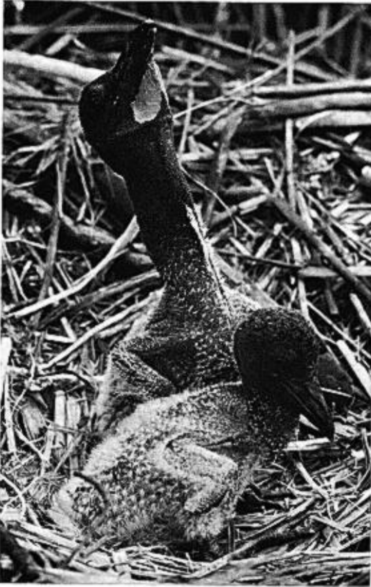
FIGURE 6. Nestling Maguari Stork, about 10 days old, giving a "greeting" display and bill-clattering to the author. Nest-mate is about 2 days younger. Note pale gular skin (orange in life), gray body down, black head down.

They were approximately 8–10 days old (14 August), 20–24 days old (26 August), and 36–40 days old (4 September), respectively. Assuming an incubation period of about 30 days, the first eggs in this area must have been laid in late June or early July.