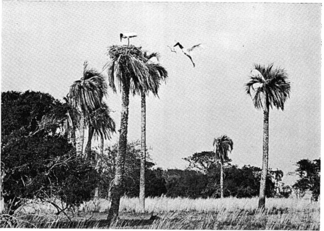
FIGURE 2. Jabiru nest no. 6 near Palmar Grande. The male is landing with a stick; female is standing on the nest.