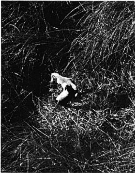
FIGURE 5. Photograph taken from low-flying plane of nest of Maguari Stork, Estancia Santa Teresa, Corrientes, on 29 August 1969. Adult at nest is giving a threat display to plane; open wings cover the two nestlings which were 23–27 days old.

central Buenos Aires Province (Gibson 1880; Weller 1967), but I found none there in 1969, owing to a prolonged drought in the area. A number of apparently newly occupied nests were observed from the air in the Estero del San Lorenzo, Corrientes Province, in late June 1969 by D. Crider and M. Rumboll (in litt.). In August and September 1969 I found at least 40–50 nests scattered singly or in loose colonies in the Estero del Santa Lucía and in the marshes of the Estancia Santa Teresa (fig. 4), northeast of Mburucuyá, Corrientes Province.