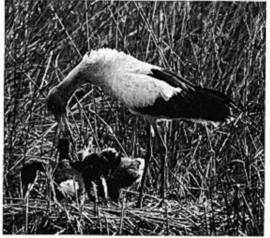
FIGURE 7. Female Maguari Stork regurgitating food for two nestlings approximately 28–32 days old. Note patch of white down in region of tail of young; tail feathers themselves (too small to be visible in photo) were black.

Nestling Maguari Storks look quite unlike their parents. Newly-hatched young have apparently not been described. An 8-day-old nestling had most of its body and wings covered with rather sparse gray down and had shorter, curly black down on the head and neck (fig. 6). Its 10-day-old nest-mate was similar but had a second coat of denser black down beginning to surpass the gray down on the body and wings. Each had a black bill with the distal 5–10 mm cream-colored and a white "egg-tooth" near the tip of the upper mandible. The naked gular skin was a bright orange, and the skin of the sparsely feathered abdomen was a shiny bluish-gray, with a stripe of pale yellow extending up the ventral apteria almost to the base of the gular region. The iris was dark brown and the legs and feet