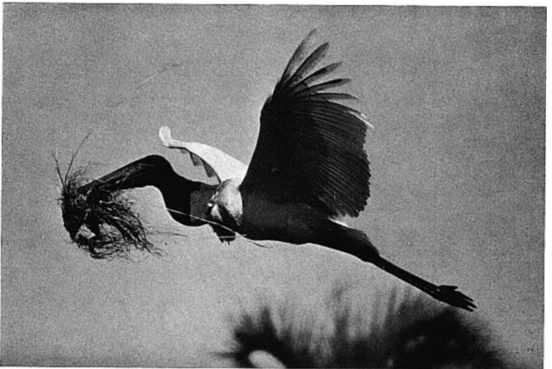
FIGURE 3. Male Jabiru flying toward nest no. 6 with a clump of grass for the lining of the nest. Note that neck is extended in flight; bulge on ventral margin is caused by loose skin of throat sac.