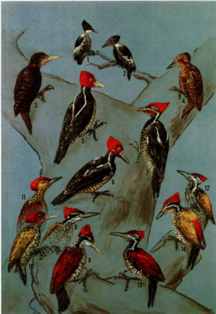
FRONTISPICEE. Some members of two evolutionary lines of woodpeckers between which pairs or larger groups of species are convergently similar in appearance. To the right of the midline are the "logcocks," to the left the "ivory-bills." Identity and collecting locality of the adult males shown are: 1. Hemicercus canente canente (Siam); 2. Meiglyptes jugularis (Siam); 3. Blythypicus pyrrhotis pyrrhotis (N Burma); 4. Micropternus bachyura phaiiceps (Burma); 5. Phloeocastes guatemalensis regius (México); 6. Phloeocastes melanoleucos malherbii (Panamá); 7. Dryocopus lineatus mesorhynchus (Costa Rica); 8. Chrysocolaptes lucidus sultaneus (N India); 9. C. l. stricklandi (Ceylon); 10. C. l. erythrocephalus (Palawan, Philippine Islands); 11. C. l. xanthocephalus (present on central Philippines); 12. Dinopium benghalense benghalense (Punjab, N Central India); 13. D. b. erythronothon (Ceylon); 14. D. javense everetti (Palawan, Philippine Islands).