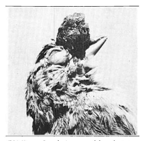
FIGURE 1. Cassin's Sparrow, adult male R.O.M. no. 97965, showing fowl pox lesion of head (\times 1\frac{1}{2}) .

An adult male Cassin's Sparrow (R.O.M. no. 97965) was observed exhibiting normal behavior in song and flight prior to its collection by J. A. Dick on 18 June 1966 in a sagebrush ( Artemisia sp.)-covered pasture on the Conover Ranch in Seward County, Kansas. Subsequent examination showed the lores and base of the upper bill to be occupied by a large, brown, hard, irregular mass (fig. 1), 15 \times 12 \times