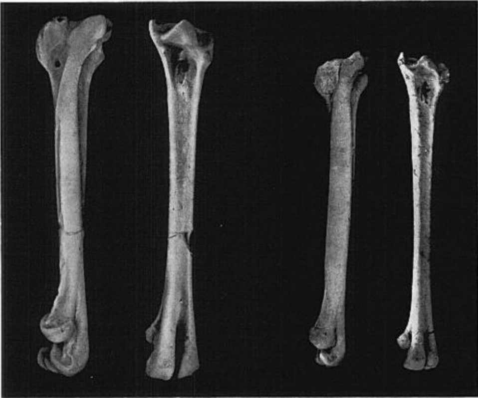
Figure 2. Left. Medial and anterior views of the type left tarsometatarsus (UMMP 52470) of Podilymbus majusculus , new species, \times 2 . Right. Medial and anterior views of the type left tarsometatarsus (UMMP 29079) of Podiceps discors , new species, \times 2 .

hypotarsus worn, collected by Claude W. Hibbard and party in the summer of 1951.