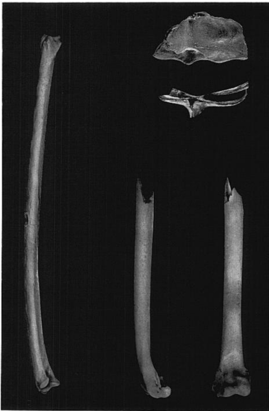
Figure 1. Upper right. Dorsal and anterior views of the type sternum (UMMP 51839) of Pleiomyces baryosteus , new species, \times 3.1 . Left and lower right. Type ulna and humerus (UMMP 45316) of Aechmophorus elasson , new species, \times 1.7 .