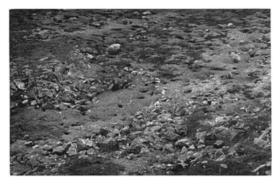
Fig. 1. Burrows of Cassin Auklets on South Farallon Island. Burrows were dug in sandy soil under granite rocks or weeded turf. At night several of these burrows held nesting adults in molt. Photograph taken July 13, 1964.

Studies on the seasonal abundance of euphausids of the coastal waters of California are still in progress (Brinton, personal communication). Seasonal changes of the standing crop of all zooplankton have been studied, however, and the abundance of zooplankton in general probably parallels the abundance of auklet food. Figure 2 summarizes the seasonal abundance of small organisms sampled within 25 miles of South Farallon Island, a distance which includes much of the feeding area of Cassin Auklets. The data are taken from a series of annual reports on the plankton volumes collected by the California Cooperative Oceanic Fisheries Investigations (Staff, South Pacific Fishery Investigations, 1952, 1953, 1954, 1955, 1956; Thrailkill, 1957, 1959, 1961, 1963). In most years zooplankton is particularly abundant from May through July and is least abundant during the winter. Food appears to be most abundant during the months the auklets are feeding the most young and are beginning the postnuptial molt.