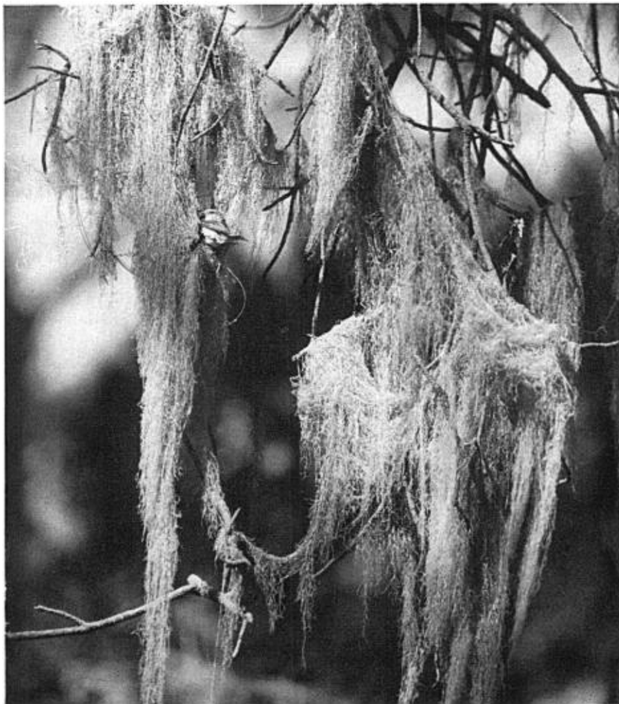
Fig. 2. Female at entrance to nest number 2 of Parula Warbler, Point Lobos Reserve State Park, July 1, 1952. Nest was placed in festoon of Ramalina reticulata in Monterey pine.

With regard to the time of breeding at Point Lobos compared to the time of breeding in the normal range, Wilde (1897:291) states that in New Jersey the species starts nest building by the second week in May. Full clutches of fresh eggs may be found on May 20, and on June 4, 1893, Wilde found a nest containing young ( op. cit. :294). Mousley (1926, 1928) observed nests being built in Quebec between May 25 and 28, 1924, and May 22 and 31, 1925. He watched a nest with young between June 13 and 19, 1921 (Mousley, 1924). In their brief study of four nests in Michigan, Graber and Graber (1951) found one nest in the building stage on July 11. In two nests, the clutches of three eggs each were completed on July 13 and 14. In one nest, the two young fledged on July 3, and in another the single remaining young left the nest prematurely on August 4.