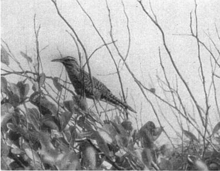
Fig. 2. Adult Yucatán Cactus Wren near its nest (lower right corner) in top of five-foot shrub, three miles southwest of Sisal, Yucatán, May 9, 1956.

given by single birds from conspicuous perches, were not common. However, one such evening song, quite different in quality from the "growling," was heard from a bird on May 7 and 8. I recorded the phrase, which was repeated several times before a pause, as what-a-luk, quaaaaark , the last note drawn out and abruptly descending in pitch. This individual's morning song, heard first at 5:10 a.m., before sunrise, was a somewhat chat-like chook chook tawúr eek , repeated three times from the top of a five-foot sisal stalk. I heard this only a few times, and only rarely after 6:00 a.m.