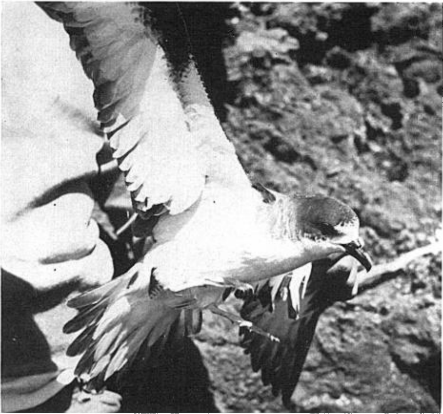
Fig. 3. Adult Dark-rumped Petrel taken from burrow at Puu Kole on Mauna Kea, Hawaii, June 13, 1954.

Adding greatly to the observations made on Maui, Woodside and Fergerson discovered, on June 12, 1954, five fresh Uau burrows near Puu Kole just over 9000 feet altitude on the southeast slope of Mauna Kea on Hawaii. All the burrows were located under old lava flows and all were over six feet long. Two of them contained birds (fig. 3), and at least one an egg. The nesting material in one was dry bracken and a little grass. The habitat (fig. 4) was similar to that at Haleakala but there were no cliffs. The Mamani ( Sophora chrysophylla ) tree line extends to about the elevation of the burrows on Mauna Kea. The shortest distance to the sea is 20 miles from this nesting area, compared to five to nine miles for the nesting areas at Haleakala.