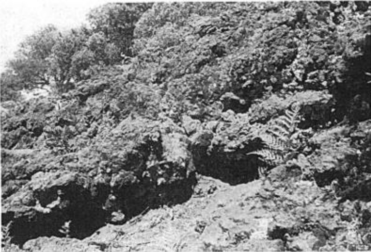
Fig. 4. Site of petrel burrow at Mauna Kea. Lava flow is old and lichen-covered; Mamani trees are in background.