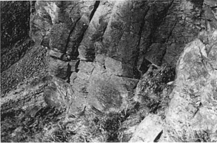
Fig. 2. Site of occupied burrow in crater. Burrow was in lower center next to block of rock some 6 feet high.

The egg found in the burrow with the Dark-rumped Petrel on June 8, 1954, was collected, since it had been accidentally cracked. It measured 62 by 44 mm. (larger than the two known eggs from the Galapagos Islands which are 61.4 by 44.1 mm., and 61.5 by