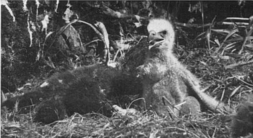
Fig. 1. Young Bald Eagle in nest east of Constantine Harbor, Amchitka, June, 1952.

sea otters revealed no immediately visible pathological changes, and the freshness of the blood and meat support the assumption that the animal was a healthy one, captured and killed by the eagle the very morning it was found. All three sea otters found in the