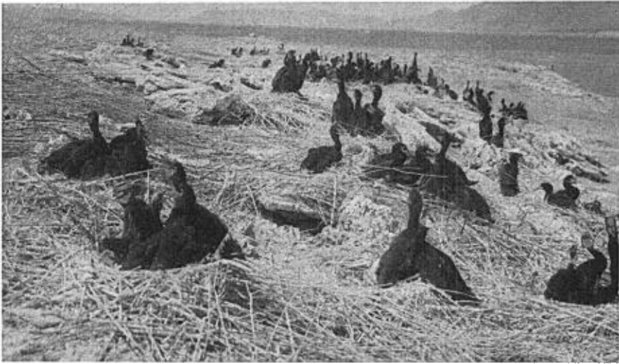
Fig. 3. A colony of almost fully grown young Double-crested Cormorants. At this stage young often hobble from one nest to another.

On July 6, 1951, Mowbray banded 150 well-grown young pelicans, 50 were banded on July 3, 1950, and in 1940 Bond banded 149 young, making a combined total of 349. At the time of this writing 15 bands have been recovered, all from birds banded either in 1940 or in 1950. Complete data on these returns are given in table 2. A large percentage of the returns have come from Mexico, indicating a migratory pattern similar to that of birds banded at Great Salt Lake. Low et al. (1950) reported returns from Mexico for 13 of 23 band recoveries. They found, however, that the birds carry on a northward migration into Idaho before going south. The greatest interval reported between banding and recovery for any pelican at Salt Lake was five years. One of the pelicans banded at Anaho Island by Bond was recovered after a period of eight years.