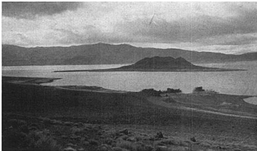
Fig. 1. Anaho Island, Pyramid Lake, Nevada, as seen from the east shore. Long peninsula to left of island will eventually join nearby point of mainland as water level recedes.

Within the last thirty years Hall (1925 and 1926), Bond (1940), and Alcorn (1943) have published observations on the birds of Anaho Island and Pyramid Lake, in west-central Nevada. Data gathered by Hall and others, who made trips to the island prior to Bond's visit, are summarized by Thompson (1932). Anaho Island has long been known for the large numbers of White Pelicans ( Pelecanus erythrorhynchos ) and other water birds which use it for nesting purposes. Thompson lists seven large concentrations of nesting White Pelicans in North America; census figures indicate Anaho Island may be the largest of these. The object of this paper is to record the present status of the nesting populations of this major pelican colony and of other water birds on the island (figs. 1 and 2).