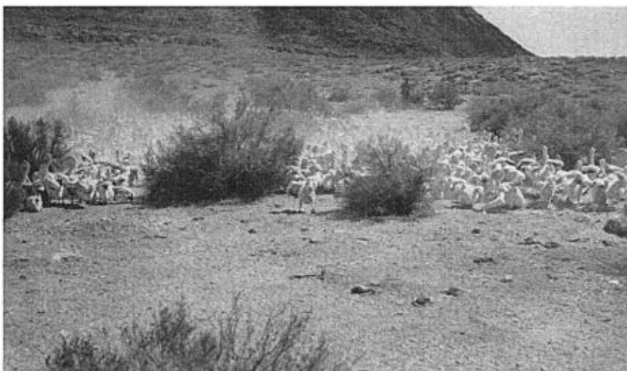
Fig. 2. Young White Pelicans on Anaho Island churning up clouds of foul-smelling dust as they scramble from photographer.