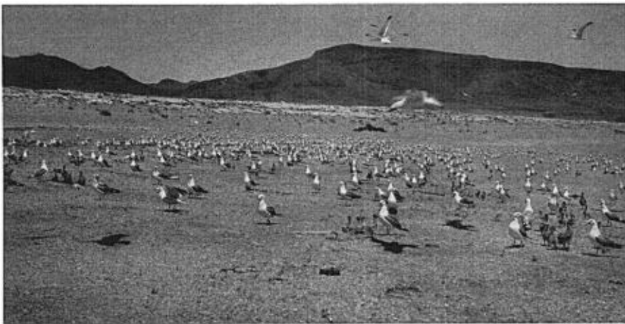
Fig. 4. Part of the colony of California Gulls on Anaho Island. Note young birds. Photographed July 26, 1950.

Larus californicus . California Gull. Like the cormorants, the California Gulls nesting on Anaho Island have increased in number. On May 15, 1951, we estimated 1,800 adults were present at a colony on a sandy beach on the south shore. A nest count, subsequently made, showed about 1,700 nests to be present. The majority of these nests contained two eggs, though egg numbers varied from one to three, and some nests were merely de-