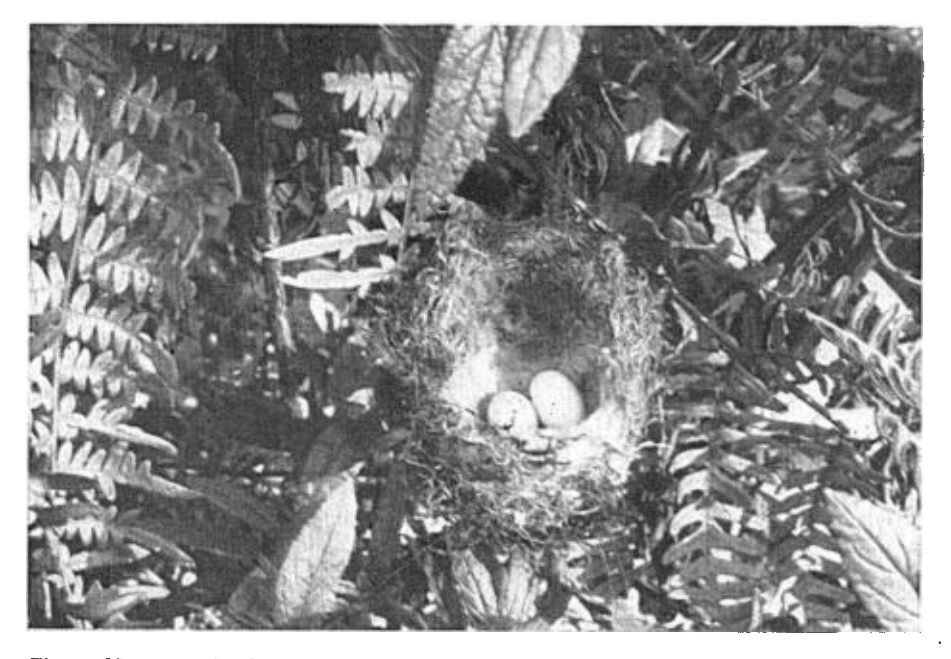
Fig. 24. Nest precariously attached to curled tips of bracken fern. A heavy rain caused the nest to stretch. Later both young fell from the nest.

Nest building continues until the young leave. Some females laid eggs when the nest was a mere platform and the eggs could be easily rolled out. Others laid eggs after the