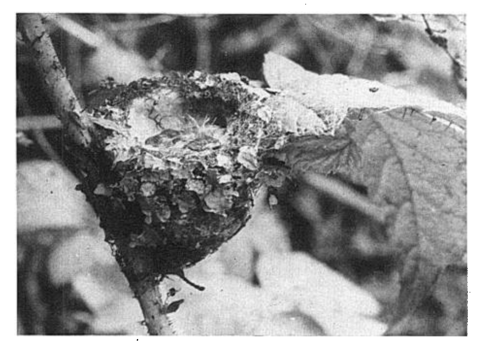
Fig. 22. Allen Hummingbird nest bound to petiole and branch of wild blackberry vine in a dense tangle on a steep streamside bank. The nest contained two young about six days old.

the down from willows, which constitutes the lining of most of the nests. Suitable locations are present on low banks as well as high ones. Food is generally abundant in the habitat. Road banks resemble stream banks as regards hummingbirds' needs except for the absence of streams and moisture, and this makes them less suitable. The necessary shade sometimes is furnished by the bank itself.