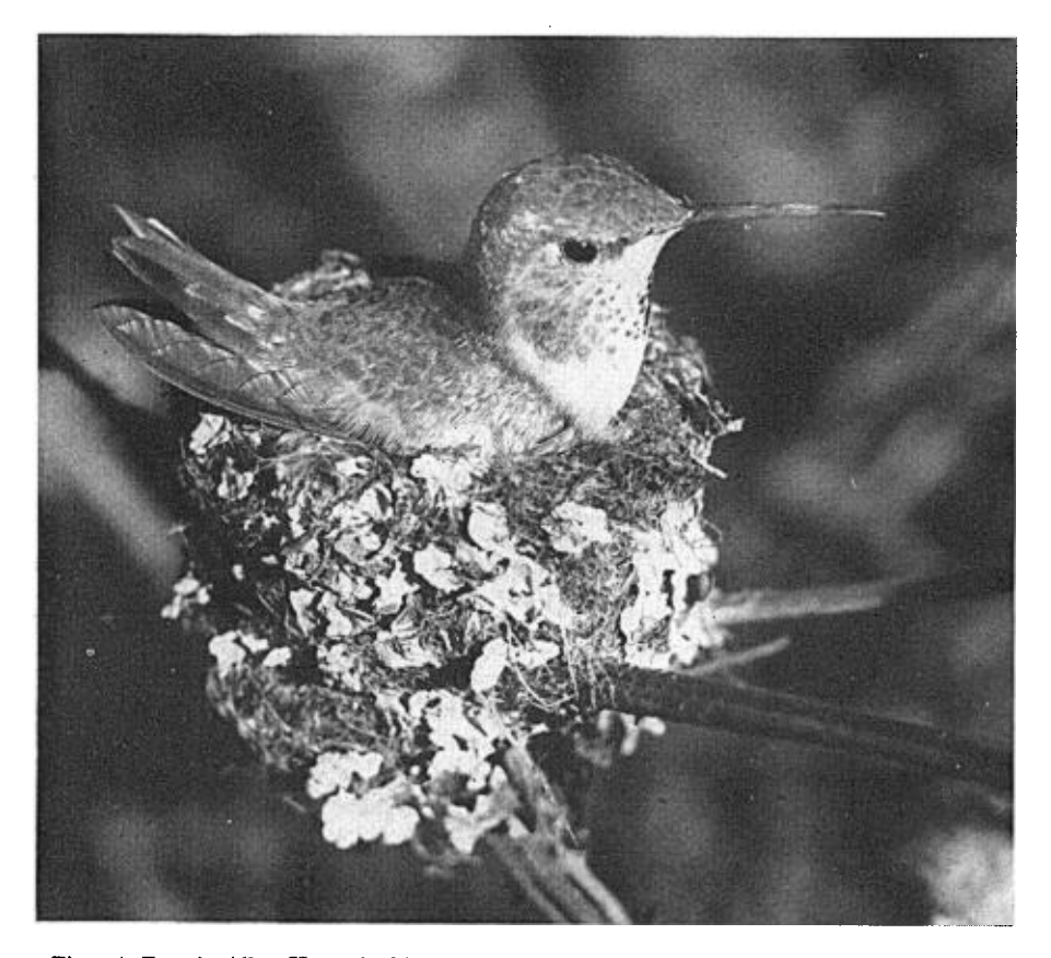
<sup>•</sup> Fig. 25. Female Allen Hummingbird in normal incubation position when temperature not excessive.

When a person is conspicuously present, actions of a nesting hummingbird are altered considerably. She does not readily approach the nest and may not return until the intruder leaves. This wariness seems to increase as incubation progresses. Continual ob-