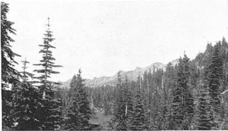
Fig. 63. Monumental Buttes, showing country typical of the higher elevations in the Main Division of the St. Joe Forest.

Lophodytes cucullatus . Hooded Merganser. Rather common migrant and occasional summer resident near St. Maries. Probably breeds. Late March to November.