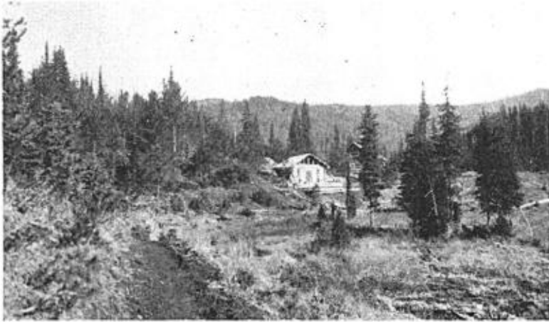
Fig. 62. Twin Creek Ranger Station, St. Joe National Forest; mountain meadow in the Canadian Zone.

Period of observation. —The author's observations in the St. Joe country began in the early summer of 1921 and continued, more or less interruptedly, to the present year. The summers of 1921 and 1922 were spent entirely in the mountains of the upper St. Joe and Little North Fork of the Clearwater, with the preceding and intervening winters at Moscow, which is only a few miles from the extreme southwestern boundary of the present St. Joe Forest protective zone. Then came an absence of seven years during which I was stationed in the Lochsa country some fifty miles to the south, followed by an equal period of almost constant occupancy and travel within the confines of the St. Joe Forest. During this latter period which extended from the spring of 1930 to the early summer of 1937, the writer crossed and recrossed the entire forest by car, horseback, and foot travel; included were several midwinter trips on snowshoes. While most of such travel was on government business not connected especially with the study of wildlife, the keeping of nature notes has been almost a lifelong habit, and these notes are the basis upon which the present list is founded. Observations in the past several years so far as the St. Joe Forest is concerned have been confined to occasional trips, as might be expected with a travel itinerary that now covers the entire northern Rocky Mountain region.