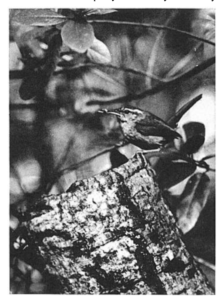
Fig. 27. Parent Bewick Wren bringing food to young in nest in hollow stump in Strawberry Canyon, June 19, 1940.

of cactus. The nest of spilurus found by Taylor was in a slender willow, next to the trunk. That found by Dyer was in a peculiar position among some timbers of a building. All three of these nests were not completely surrounded by walls as they usually are.