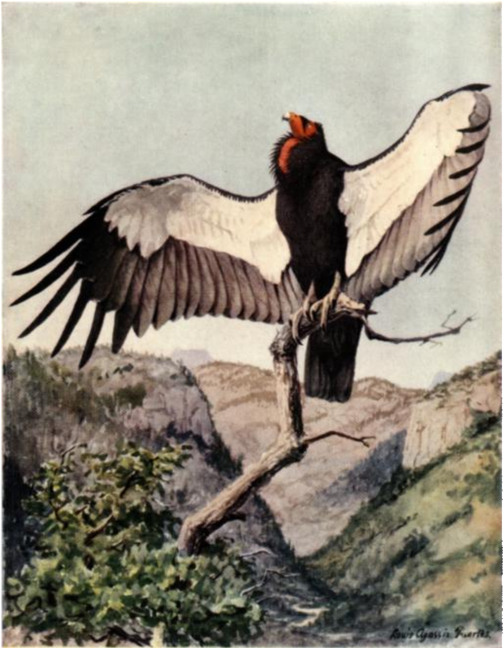
Fig. 1. California Condor. Water color by Louis Agassiz Fuertes drawn from studies made in California in 1903.