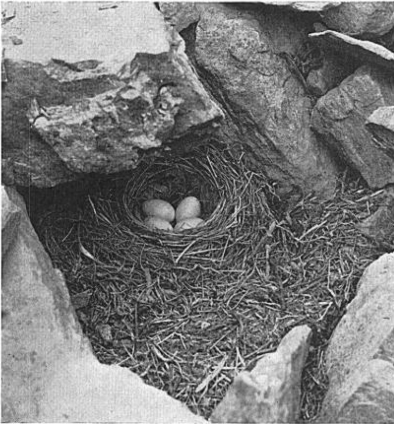
Fig. 38. Nest and eggs at site shown in figure 37; July 9, 1939.

In order to photograph the nest in location and thus add to the knowledge of the habits of these elusive birds, we removed the flat rock which covered the nest. Four pure white eggs lay on the smooth lining (fig. 38). Although entirely white, the shell was almost translucent in places, causing it to have a faint pinkish tinge. The crevice between the rocks, in which the nest was placed, was filled with trash until it was level