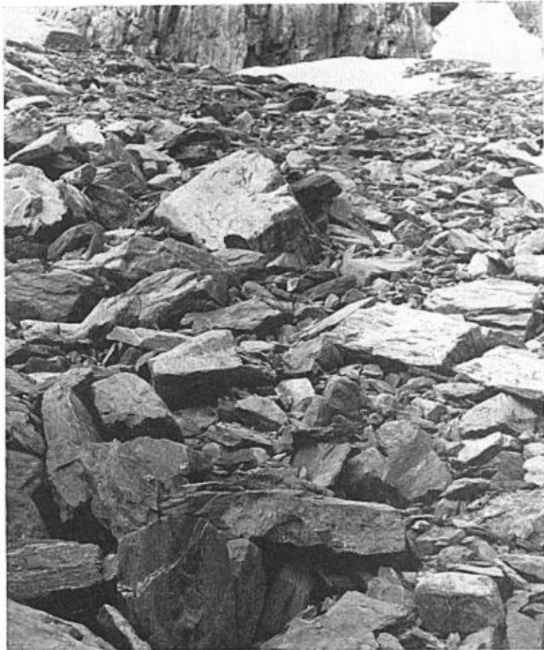
Fig. 37. Nesting site of Sierra Nevada Rosy Finch, near Saddlebag Lake, Mono County, California. Nest situated under large flat rock in center foreground. The bird entered through the triangular opening.

long climb up the rock slope we were greatly cheered to see a bird flying up toward the location. When we reached the site of the nest we set up our cameras and prepared to take pictures. Only the female was near the nest. Each time she came, she flew about, alighting here and there close by, before she entered the crevice to brood her eggs for