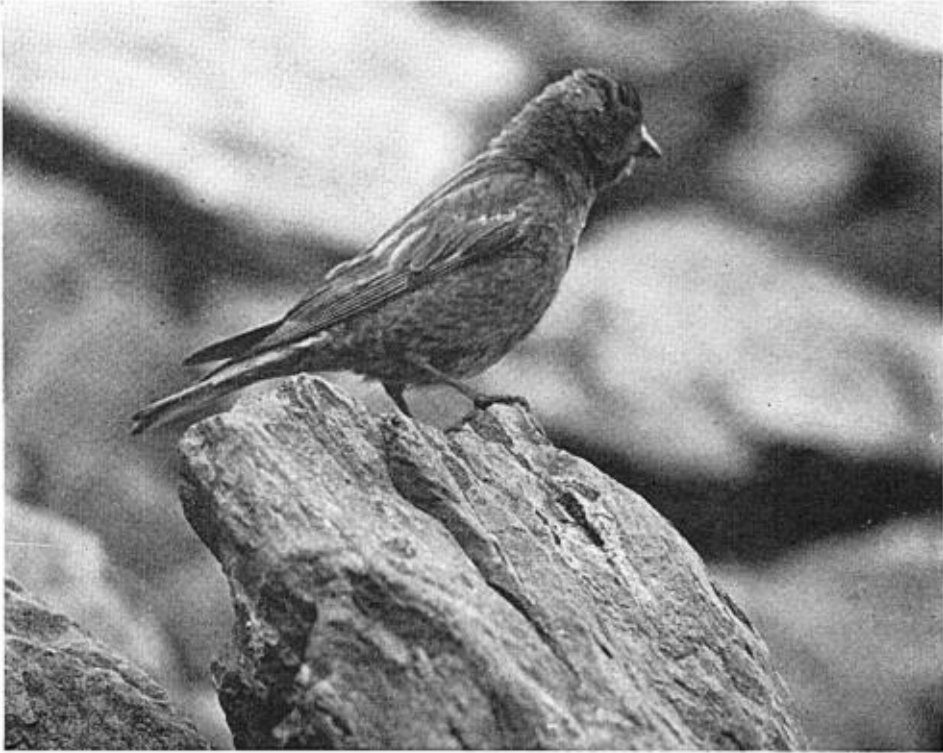
Fig. 40. Adult rosy finch near nest.

other at all angles and small caverns led back under the precariously tilted rocks. As we climbed about, a rock settled against another with a grating sound and almost instantly a bird flew out of an opening under a great stone which lay in a horizontal plane upheld by other rocks. My husband squeezed through the small opening from which the bird had flown and slid down into a cave. When his eyes became accustomed