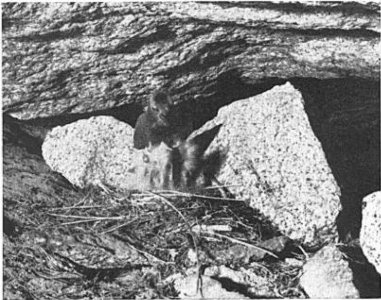
Fig. 41. The parent entered the cave and fed the five young birds; nest near Ellery Lake.

We spent nearly three hours watching these finches during the afternoon. It was very cold, as a chilling draft blew from back under the rocks in the dark recesses of the cavern. Ice stood in the depressions of the floor. We made careful observation of the movements of the birds and found that it was about 45 minutes between the visits of the parents to the nest. They came together only the first time, each coming separately thereafter. We felt that their coming together was merely a coincidence. Each