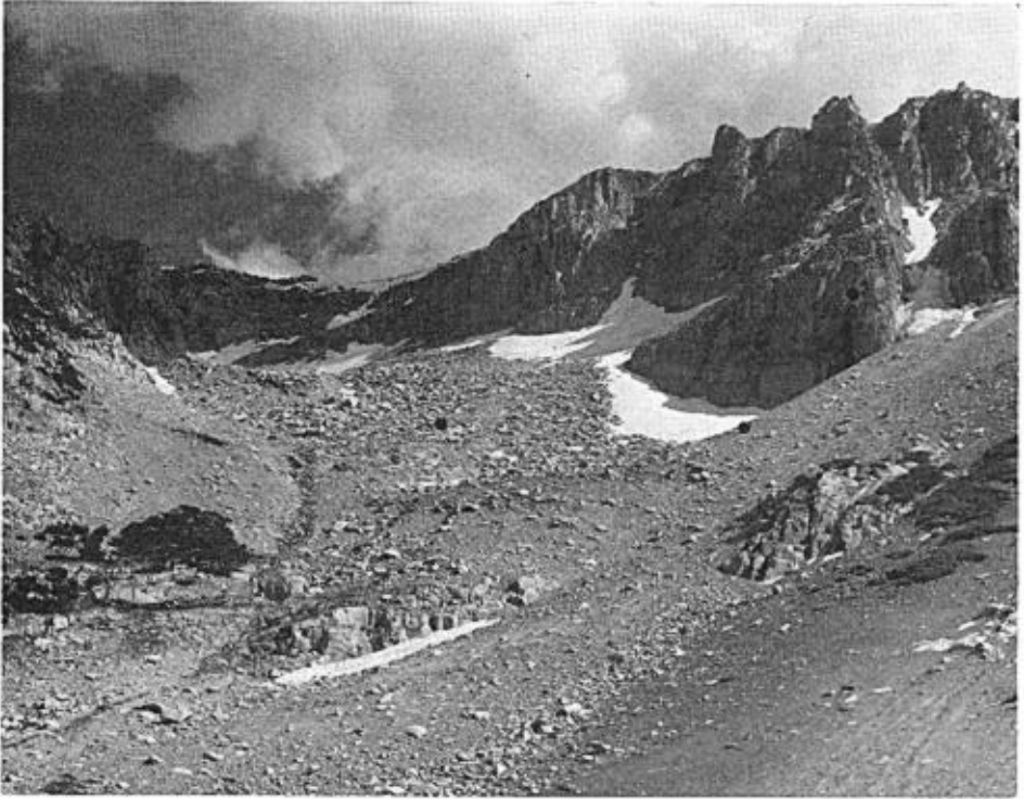
Fig. 39. Cirque near Ellery Lake, Mono County. Locations of three leucosticte nests are marked by black dots, one in large boulders (shown in fig. 41), one on ridge of rock slope, and one in cliffs to right.

a rock up near the edge of the snow field. The five young birds were quite large and made their presence known by squealing loudly when they were fed. This nest was placed on a bed of sandy gravel which had evidently been deposited between the rocks as the snow receded in the spring. Both parents were feeding the young, flying up from