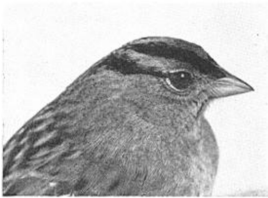
Fig. 13. Hybrid between Zonotrichia coronata and Zonotrichia leucophrys . The gold areas show as dark gray.

Above the eye of the hybrid, in the superciliary stripe, is a small patch of gold. This mark, which is not found in the nuptial plumage of either parental species, evidently results from the elimination of black from the superciliary area, thereby permitting the appearance of gold which otherwise is suppressed or obscured. The stripe pattern of gambelii has made possible the appearance of the gold of coronata in an unusual region. The gold spot is not situated anterior to the eye as is the yellow of the White-throated Sparrow ( Zonotrichia albicollis ). This fact, the curvature of the lateral black stripes on to the nape and the presence of gold in the median area seem to preclude albicollis as a possible parent of the hybrid.