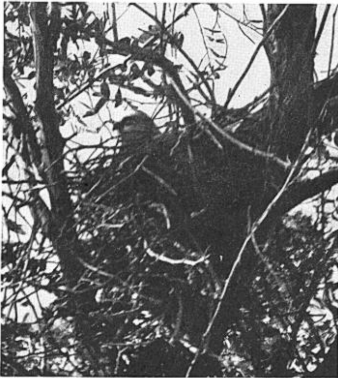
Fig. 20. Mississippi Kite on nest in locust tree; Arnett, Ellis County, Oklahoma.

On the morning of May 19 I chanced to see a Kite perched in a locust tree not far from the highway. Thinking that it might be in search of food I stopped the automobile and watched. It was a male, this I knew from the clear whiteness of its head. As I watched, the bird moved awkwardly out the branch, leaned forward, nipped off a leaf-covered twig, and flew across the highway with the green sprig in its bill. Leaving the car quietly I made my way through the shinnery oak and locust scrub to a tangle whence I could watch the tree toward which the Kite had flown. Soon I saw the female, perched on a dead bough. Not far from her the male stood on the partly finished nest, fussing with his green frond, picking it up, shaking it, dropping it. The female flew to the ground, grasped a small twig with one foot, and flew to the nest. I saw no more nest-building that day, though I watched the completely unfrightened birds for another hour.