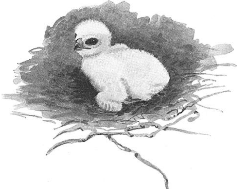
Fig. 23. Mississippi Kite, seven hours old. Drawn by author at Arnett, Oklahoma, June 18, 1936.