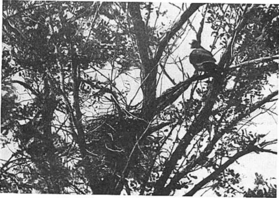
Fig. 21. Mississippi Kite near its nest; Arnett, Ellis County, Oklahoma.

Many a last year's nest is put into shape for use with the addition of a small handful of twigs and a lining of fresh leaves. These leaves often are gathered from the very tree