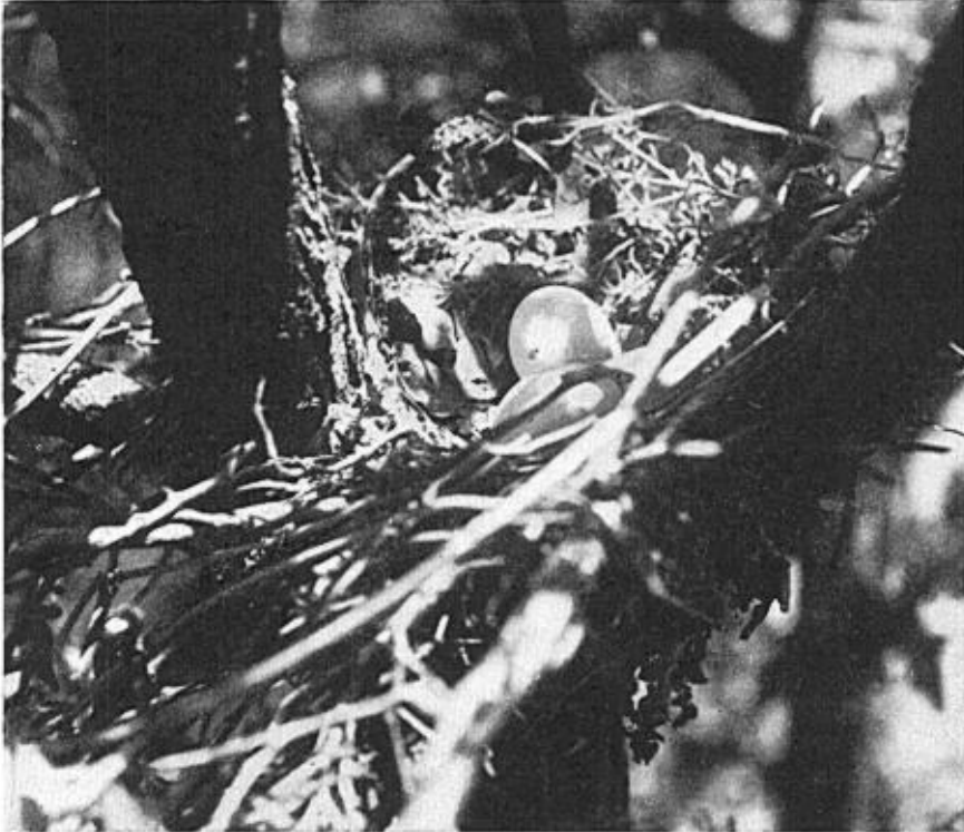
Fig. 22. Mississippi Kite's nest in "shinnery" oak about six feet from ground; near Peek, Ellis County, Oklahoma.

In another tree, a cottonwood that stood along the South Canadian River, we found a Kite nest with two eggs, a Mockingbird nest with four eggs, a Mourning Dove nest