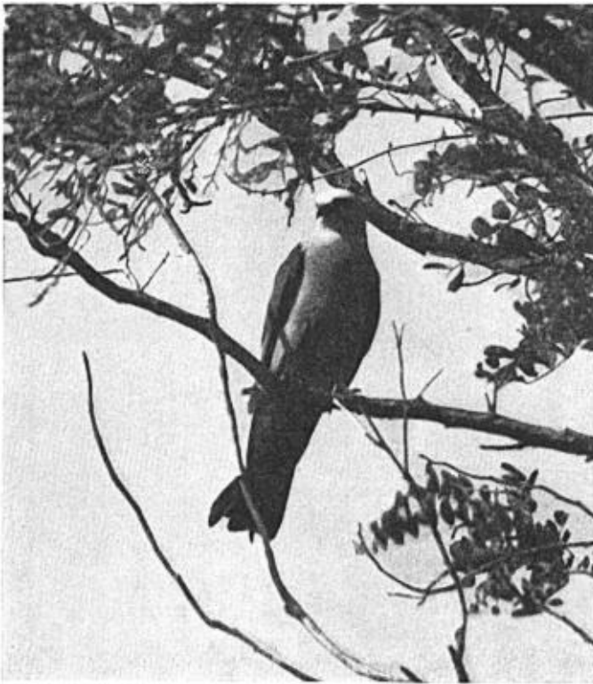
Fig. 19. Mississippi Kite on favorite perch near nest; Arnett, Ellis County, Oklahoma.

At that time I did not know that it is customary for the Kites of western Oklahoma to return to their old nest, to linger about their established nesting-territory for days without so much as adding a twig to the ramshackle structure, and to go at their re-