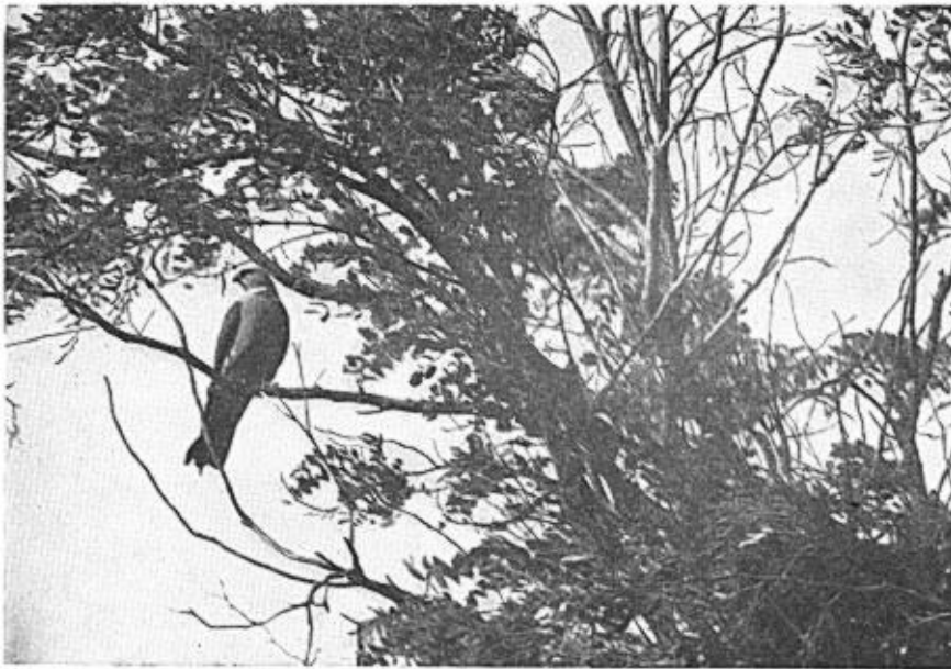
Fig. 18. Mississippi Kite on favorite perch near its nest; Arnett, Ellis County, Oklahoma.

Neither in 1936 nor in 1937 did I see what I would call "courtship antics." This I regard as evidence of early mating, and perhaps of mating for life. To be sure male birds (females, too, for that matter) sometimes "displayed" by cutting capers in air, pursuing the other bird with thin squeals and chipperings, or plunging from a height to swoop upward effortlessly.