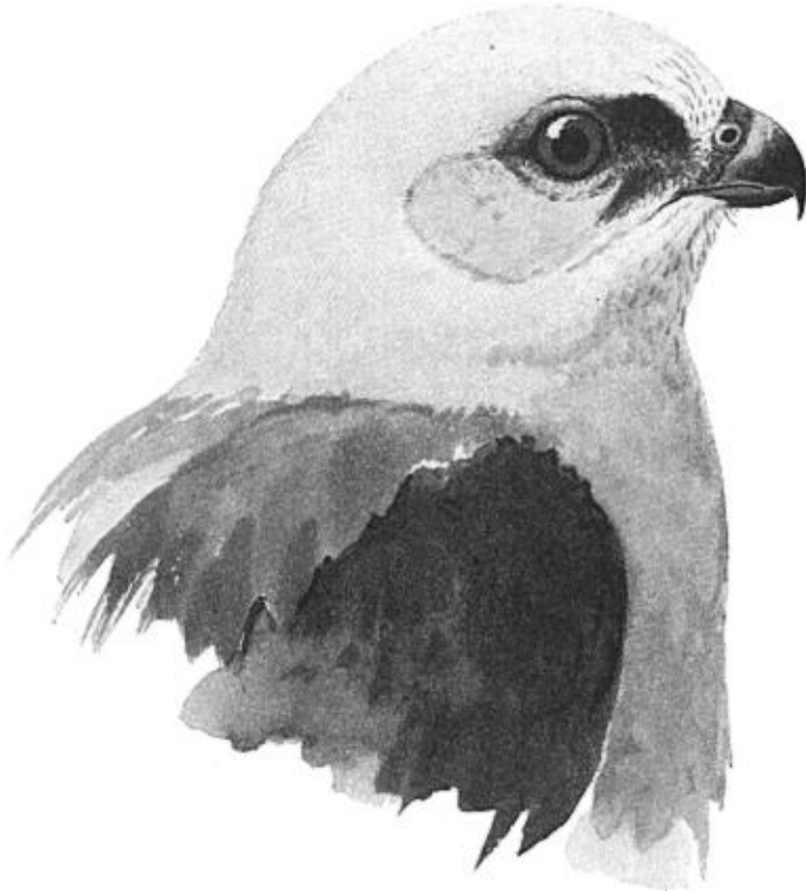
Fig. 24. Mississippi Kite; drawn by author at Arnett, Oklahoma, May 16, 1936.

Personally, I am not alarmed about destruction of the Kites or their nests by cattlemen, gunners, and Game Commission officials. Even the sportsmen, who are interested in saving baby Bob-whites and Prairie Chickens, know fairly well by this time that the Kite is not an enemy of game birds. But about the professional egg collector I am alarmed. Mississippi Kite eggs are known to be "good" eggs. They may be dirt-