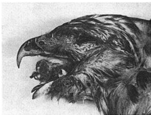
Fig. 52. Head of a Red-tailed Hawk killed by the skull of a Ground Squirrel.

Red-tailed Hawk Choked by Squirrel Skull. —While collecting in the foothills near the old deserted town of Nortonville, Contra Costa County, California, I found a dead immature Red-tailed Hawk ( Buteo borealis calurus ) that apparently had been killed by a mammal skull which had lodged in its throat. The skull was so tightly wedged in the throat that it could not be removed until the skin was cut away. Upon examination the skull proved to be that of the ground squirrel, Citellus beecheyi .