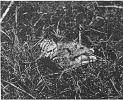
Fig. 50. Avocet chick on San Pablo Bay marsh, May 12, 1934.

Though we found no evidence that the pelicans were nesting, or had nested, we observed while we waded in the marsh a couple of pairs of American Avocets ( Recurvirostra americana ). As we approached one of the small, grassy islands in the marsh, these avocets vociferously resented our trespassing. I had had experience in the Los Baños marshes with nesting avocets, and a little search disclosed two nests on this island of not over two square rods in extent. Parts of egg shells showed that the eggs had already hatched. Some six feet from one of the nests I located one avocet chick which I estimated was not over two or three days old. It made little or no attempt to get away from us, and I had no trouble in taking the accompanying photo (fig. 50). We noted that the legs seemed rather large for the size of the bird, but when I placed it in the water, the little fellow put these large legs to good use and swam rapidly to the edge of another small island (fig. 51).