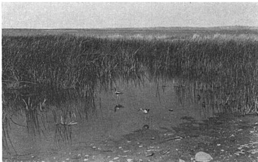
Fig. 35. Typical bulrush growth along southwest shore of Lake Bowdoin, showing two Avocets and a pair of Wilson Phalaropes at a favorite feeding ground. Photographed June 7, 1935.

Oxyechus vociferus vociferus . Killdeer. Occurs regularly along the shores and occasionally on the larger islands. Our count in 1935 totaled 66 individuals.