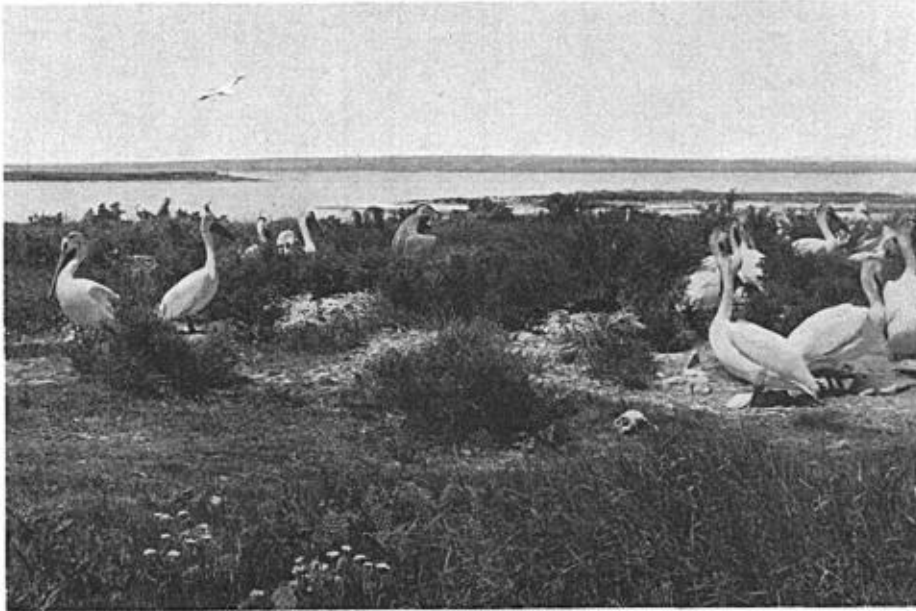
Fig. 36. A small section of the White Pelican colony on Woody Island. Photographed June 10, 1935.

level of the lake exposed several small sandy islands suitable for nesting areas. The birds nest peacefully among avocets, gulls, ducks, and geese, favoring the exposed beaches with scant cover. A shallow depression in the sand or gravel, usually bare, but sometimes lined with grass, reed-stalks, and feathers, receives the two or three eggs, which exhibit considerable variation in color. In 1935, 15 nests on Avocet Island contained 1 to 3 eggs each by June 11; of 13 nests on Daddy's Island, 5 contained 1 egg each on June 13, the rest 2 eggs each; about 25 nests on Woody Island contained 1 to 3 eggs each on June 8. The stage of nesting was similar in 1932 and 1933, but in 1934 most of the Common Tern eggs had hatched or were hatching by June 17.