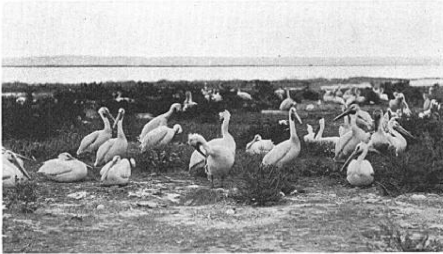
Fig. 33. Typical view on Woody Island, showing characteristic plants, two Double-crested Cormorants on their nests, a Great Blue Heron shading its young from the sun, and White Pelicans at their nests. Photographed June 10, 1935.

near Malta, Mont., in August and September, 1915, killed large numbers of shore-birds and many ducks. A few birds were still affected after the 1st of October. Individuals examined at this time had the same malady as the ducks in Utah, but it can not be stated definitely that all had died from this trouble." (U. S. D. A. Bulletin No.