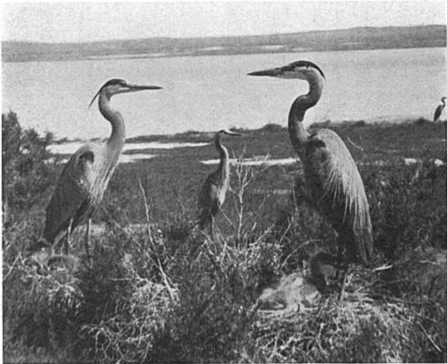
Fig. 34. Great Blue Herons at their nests on the ground of Woody Island. Photographed June 10, 1935.

The season of nesting has varied greatly during the four years of our visits. In 1932 all of the eggs had hatched by June 19, and most of the young were more than half grown. In 1933 by that date about half of the young birds were large enough to band. The following season only about half of the eggs had hatched by June 17, and about 120 nestlings were large enough to band. A season of nesting similar to the last was indicated in 1935. The nests are composed generally of a heavy lining of sticks and twigs laid over a crater-shaped mound of dirt two to three feet across and four to eight inches high, though in some cases the lining is scanty or missing.