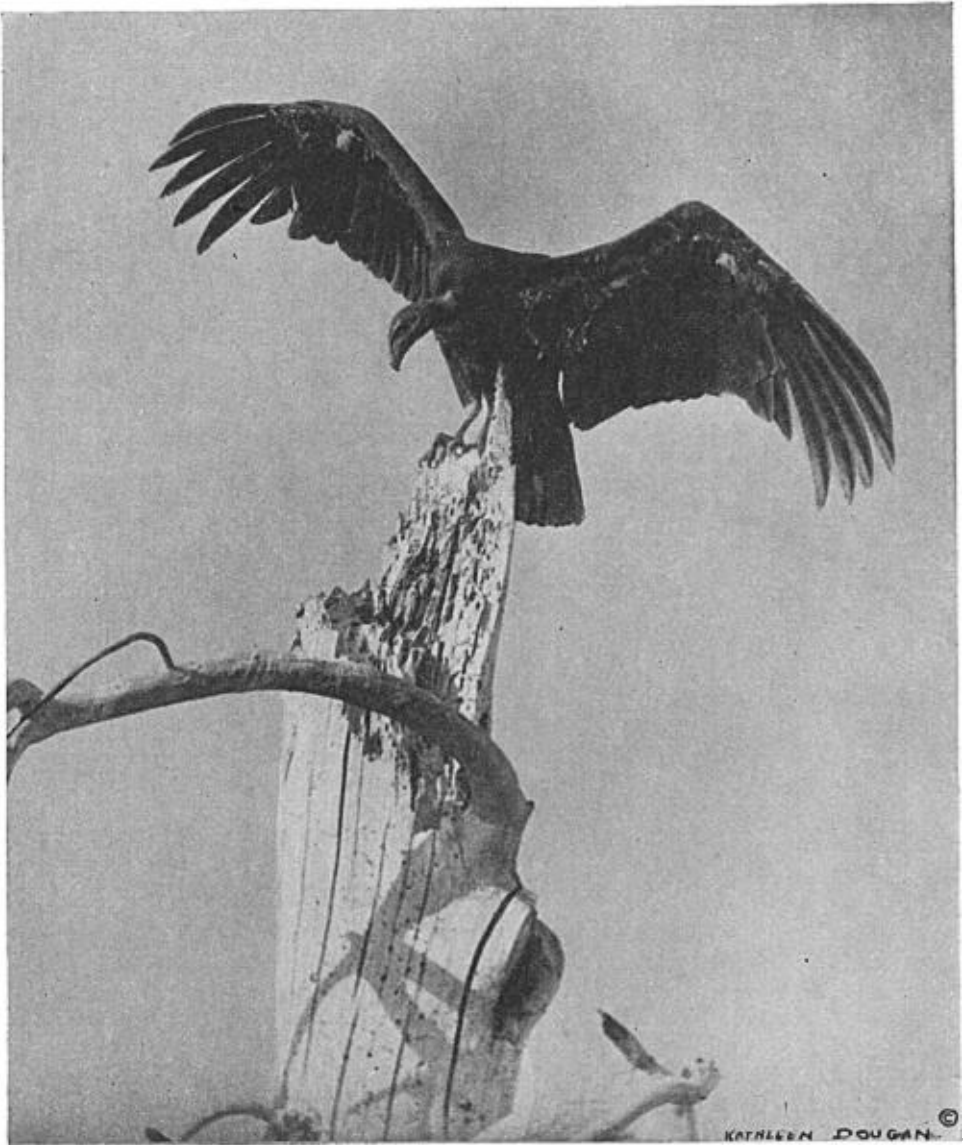
Fig. 1. Attitude assumed by the young condor when startled. The bird is looking down at the disturber.