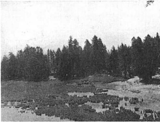
Fig. 16. MEADOW COVERED WITH HELLEBORE NEAR BLACK BUTTE (6800 FEET); AT THE SUMMIT OF THE INNER COAST RANGE.

made on these two trips enabled me to map accurately the extent of the Canadian life-zone in this region. The accompanying map shows the area above 5000 feet elevation, where Canadian zone conditions prevail. One would be inclined at first