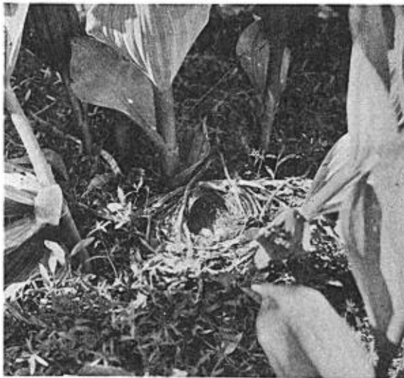
Fig. 17. NEST OF FOX SPARROW ON GROUND IN MEADOW, SHELTERED BY THE HELLEBORE.

to think that this area is simply a southward extension of the Canadian region from the Salmon-Trinity alps. My opinion, however, based on comparison of the bird life of the Yolla Bolly region and that of the Trinity region (Kellogg, Univ. Calif. Publ. Zool., 12, 1916, pp. 379 ff), is that the Yolla Bolly region is an isolated area with an