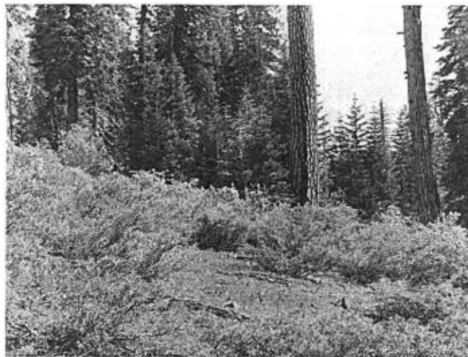
Fig. 15. SOLID STANDS OF SNOWBRUSH AT PLASKETT MEADOWS (6000 FEET). AT THE LOWER BORDER OF THE CANADIAN, ON THE EAST SIDE OF BLACK BUTTE, WERE DENSE STANDS OF THE SNOWBRUSH, AFFORDING EXCELLENT COVER FOR FOX SPARROWS.