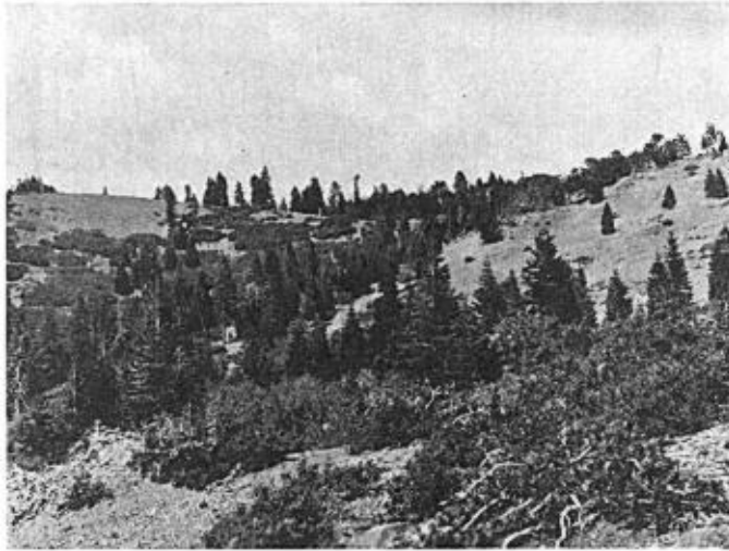
Fig. 14. LOWER EDGE OF PLATEAU ON SNOW MOUNTAIN. Off to the left the mountain drops away steeply into the yellow pine Transition and chaparral. In the picture, taken at 6,000 feet, Jeffrey pines mingle with young red firs, and several species of manzanita come up from below to meet the cherry and snowbrush of the Canadian life-zone. On the distant hill Quercus vaccinifolia grows in abundance. The locality here pictured was where we first heard the Fox Sparrow singing.