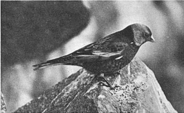
Fig. 34. HEPBURN ROSY FINCH ( Leucosticte tephrocotis littoralis ).

thus far," while a week later, just before migration, we noted that "the bills were much darker than earlier," being almost as dark as specimens taken at the height of the breeding season.