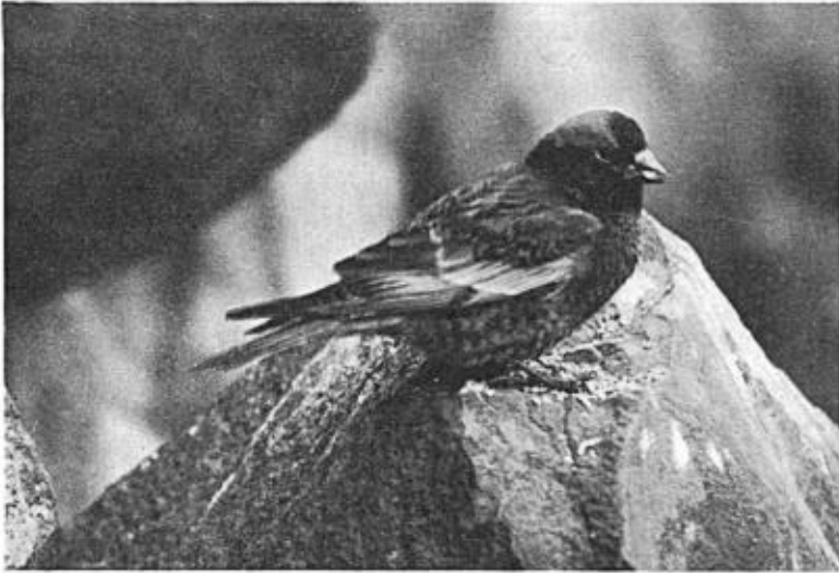
Fig. 33. GRAY-CROWNED ROSY FINCH ( Leucosticte tephrocotis tephrocotis ).

the males. The changing coloration of the bill is probably the best index of the beginning of the breeding season. In birds of late autumn and early winter the bill is yellowish with dusky tip. In some in early January the bill was almost entirely yellow. However, even as early as February 1, the bills of a few were turning darker. A bird taken March 3 showed "a darker bill than the majority