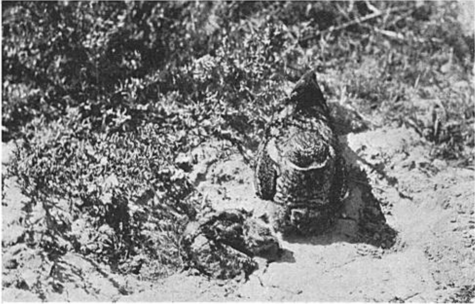
Fig. 19. ADULT TEXAS NIGHTHAWK AND YOUNG AFTER SECOND SHIFT OF HOME SITE CAUSED BY DISTURBANCE. THE HEAD OF THE SECOND YOUNGSTER IS HIDDEN BENEATH THE BROODING ADULT. PHOTOGRAPHED JULY 27, 1930.

In order to prevent the parent from again moving the young, I tied them