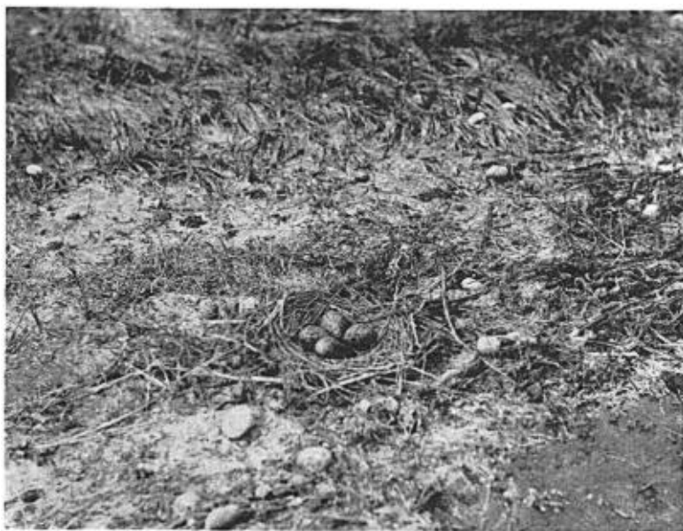
Fig. 4. NEST AND EGGS OF AMERICAN AVOCET.

Recurvirostra americana. American Avocet. Avocets are common in Salt Lake Valley, but do not breed in any of the surrounding mountain parks. The first arrivals reach Salt Lake City and vicinity about the last of March, and by April 10 the birds are common. I believe that the avocets, like the willets and curlews, are already mated when they arrive, because they take up the duties of housekeeping at once. These noisy and showy birds frequent the mud flats and shallow alkali ponds, where some are continually in the air and their persistent yelping becomes