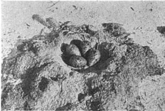
Fig. 5. NEST AND EGGS OF THE AMERICAN AVOCET.

The first eggs are laid by April 15 and the breeding period is extended until well into June. However, the later nests are probably second efforts. After the eggs are hatched both parents are very solicitous of the young and take care of them until they can care for themselves. I have seen them attack a dog in the protection of their offspring. When surprised on an open mud flat, the adult birds will drive their chicks to the nearest cover before centering their attention on the