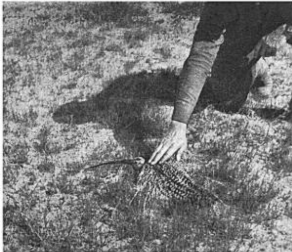
Fig. 10. THE AUTHOR STROKING A CURLEW WHILE ON ITS NEST.

I believe that the curlews are diminishing in numbers within the Salt Lake Valley. My own observations were not extended over a sufficient length of time to obtain any definite count; however, vast areas of their former breeding range