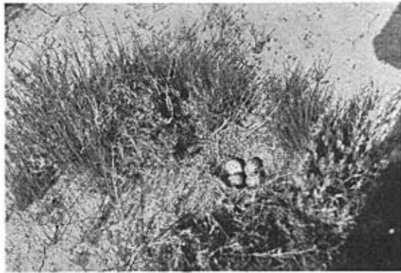
Fig. 7. NEST AND EGGS OF THE WESTERN WILLET.

The usual number of eggs is four, occasionally only three. The eggs of this species run through a greater range of color and markings than do the eggs of any other of the local Limicolae . The ground color varies from a pale light green, gray and drab to dark brown, and the shell markings from lilac to deep chocolate.