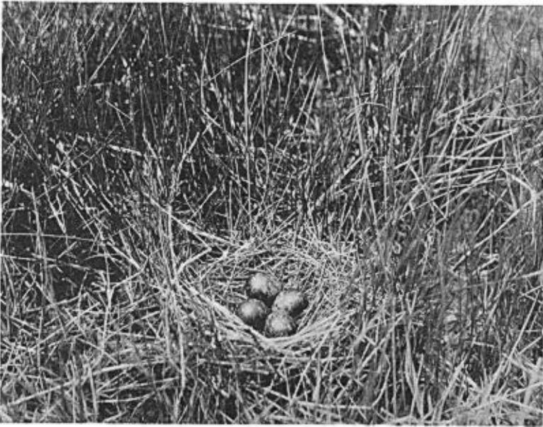
Fig. 6. NEST AND EGGS OF THE WILSON SNIPE IN SMALL MARSH NEAR PARK CITY, UTAH.

With this nest and the surrounding terrain as a guide, I located at least fifteen breeding pairs in the immediate vicinity of Salt Lake City. The situation was