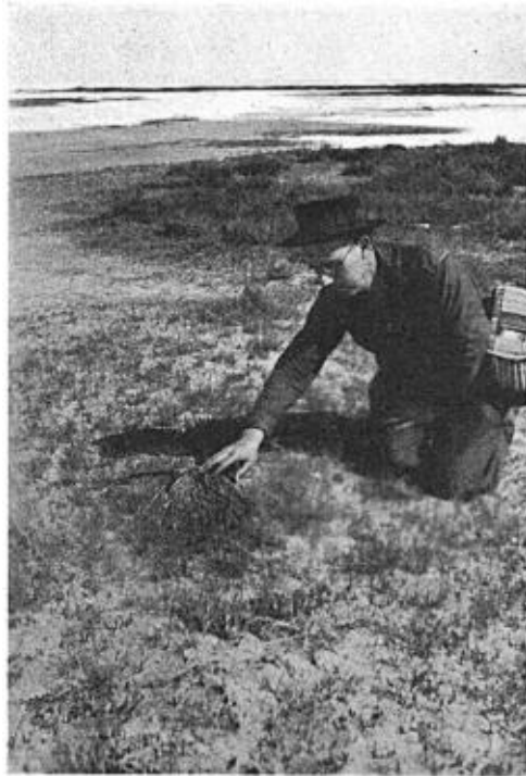
Fig. 9. MR. A. D. BOYLE AND HIS "PET" CURLEW.

In the selection of a nesting site, a pair of curlews may locate any place on the prairie, yet these birds most frequently use certain places that can be recognized as characteristic. The ideal location is in short grass and on a slight rise of ground, close to and overlooking a wide alkali deposit. The picture with Mr. Boyle at a nest is most typical (fig. 9). The white areas in the background are bare alkali flats. When not disturbed, the male curlew spends much of his time as a guardian of the nest and will be standing around some place within about a hundred yards of the incubating female. Whenever an intruder appears, the male flies out to meet him, then circles around and around, all the time uttering loud cries of protest. The incubating female sits very close to the nest and is usually flushed within a few steps. When she leaves the nest, with a lusty squawk, her action is quite