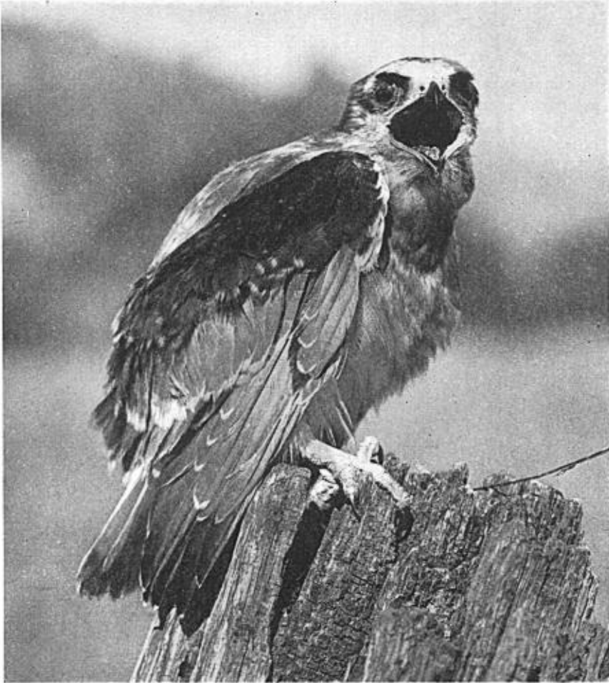
Fig. 81. THE FIRST STAGE IN SELF DEFENSE WAS TO OPEN THE MOUTH ENORMOUSLY AND TO SCREAM.

upon the tail. The third and last stage is to drop completely on the back and to present the most impressive weapons a Kite has, the talons (fig. 82). That this is purely an instinctive response to fear is proved by the fact that the nestlings would execute this maneuver when they had not yet learned to bite a finger thrust into their wide gape and clutched but weakly with their claws when an object was put into their grasp. Just prior to nest leaving they learned to use their beaks, and