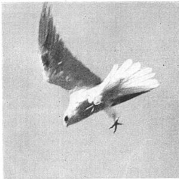
Fig. 80. WHITE-TAILED KITE ABOUT TO ALIGHT ON NEST.

On January 26, 1929, at the Los Altos Country Club, a Kite was seen to drop in the manner above described and fetch an object (perhaps a field mouse) from the