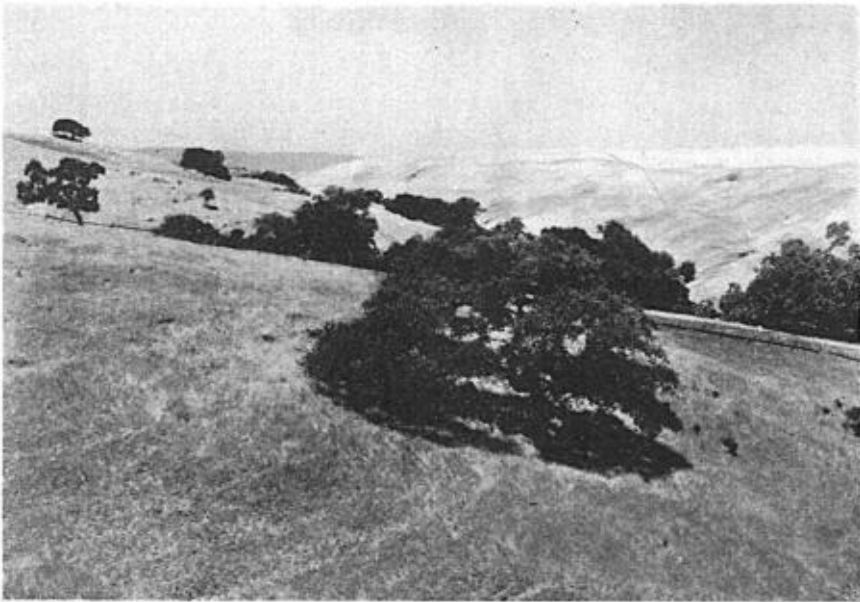
Fig. 76. THE HOME OF THE WHITE-TAILED KITE IN THE SILVER CREEK HILLS, SANTA CLARA COUNTY, CALIFORNIA. NEST NO. 2 WAS IN THE VALLEY OAK OF THE FOREGROUND.

To one acquainted with the foothills of the inner coast range of California but little need be said of their topography and flora. In their wider valleys intermittent streams are lined with willows and sycamores, with scattered coast live oaks ( Quercus agrifolia ) and orchards of valley oak ( Quercus lobata ) on the rolling lands of either side. The narrower cañons and wetter stream beds have California