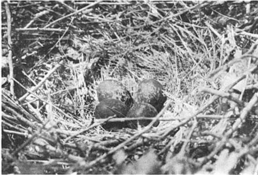
Fig. 77. EGGS IN NEST NO. 2 OF THE WHITE-TAILED KITE, PHOTOGRAPHED in situ .