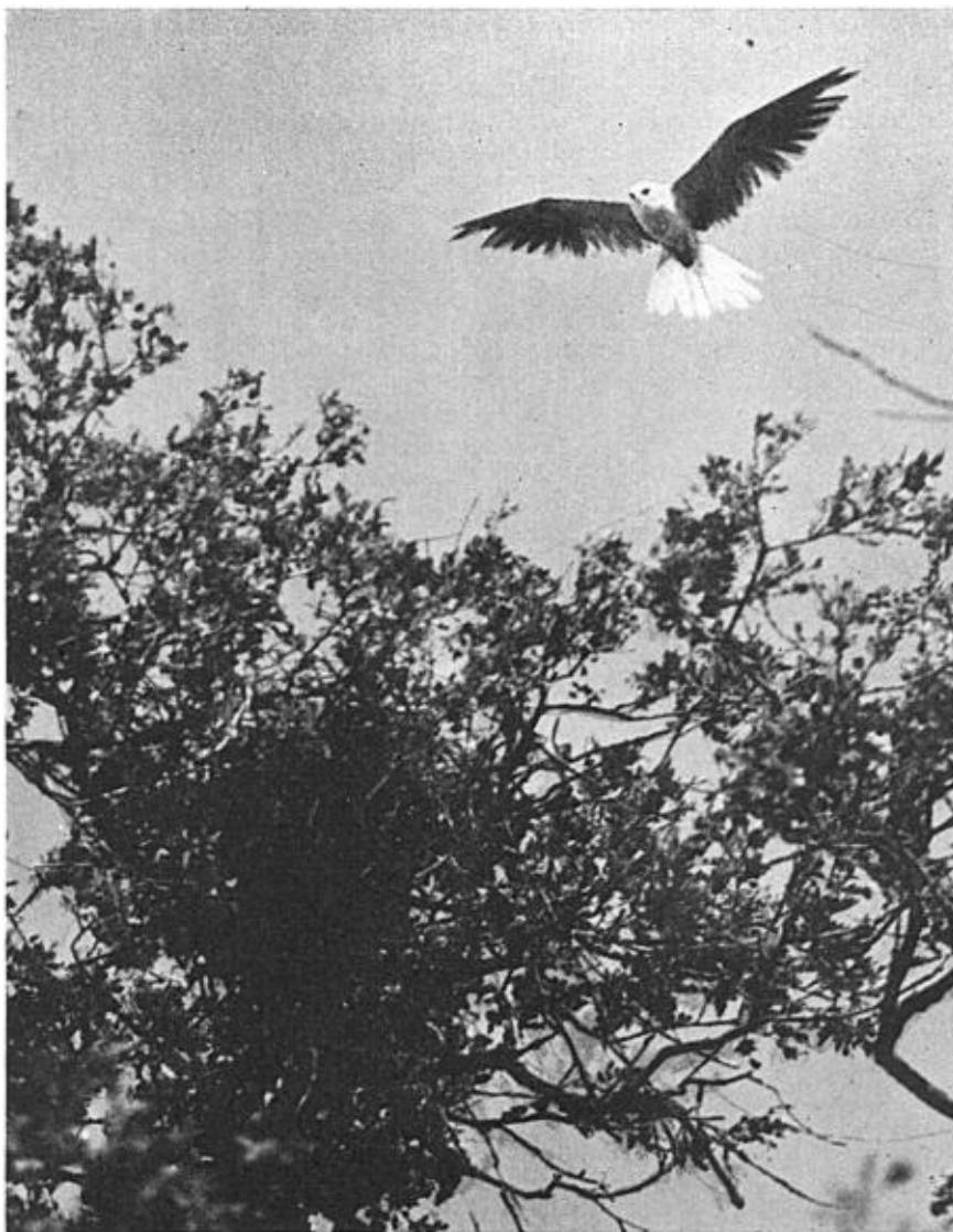
Fig. 79. WHITE-TAILED KITE IN "STAND" OVER NEST IN VALLEY OAK.

at times, seeming to abandon itself to the fury of the gales, is blown away like thistle down until, suddenly recovering itself, it shoots back to its original position. Where there are tall lombardy poplar-trees these birds amuse themselves by perching on the topmost slender twigs, balancing themselves with outspread wings, each