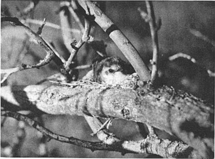
Fig. 78. Female Vermilion Flycatcher brooding. This bird was unusually confiding, returning to her nest and eggs while the photographer sat in plain view not more than three feet away.

Empidonax difficilis difficilis . Western Flycatcher. First observed on March 26, it was seen more or less regularly thereafter until at least May 12. This is a very quiet bird, frequenting shady spots and therefore easily overlooked.