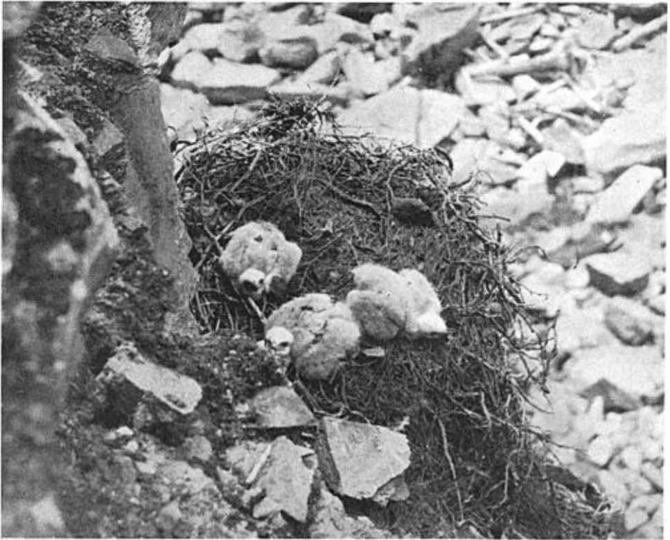
Fig. 35. NEST AND YOUNG OF AMERICAN ROUGH-LEGGED HAWK; GOLOVIN BAY, ALASKA, JULY, 1921.

Hawks were very scarce in the Arctic during the summer of 1921, and only one specimen was collected. This, a Duck Hawk, was taken by a native near Icy Cape on September 6, and we saw another the same day. At Wainwright a hawk was seen on September 15 and one on September 19; what species I do not know. When off Point Martin, near Demarcation Point, August 13, a Duck Hawk, pursued by an Arctic Tern which kept darting at it from all angles, hovered over the ship for about ten minutes, starting several times to alight in the rigging.