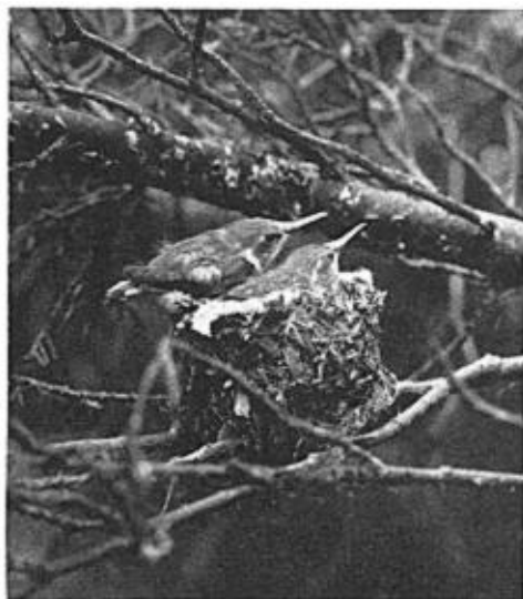
Fig. 29. A SINGLE ALLEN HUMMINGBIRD IN THE PINFEATHER STAGE. NEST BUILT IN EUCALYPTUS TREE.