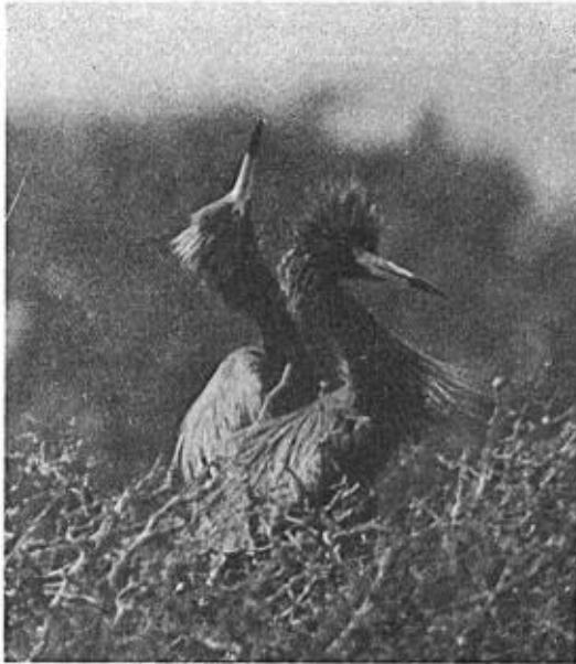
Fig. 6. A PAIR OF REDDISH EGRETS IN FULL BREEDING PLUMAGE. THE MALE, BIRD TO RIGHT, HAS JUST FINISHED THE NUPTIAL DISPLAY.

We arrived late in the afternoon, too late to make any systematic investigations, but a short walk into the brush showed me that a great change had taken place since the 10th, for now nesting was in full swing and nearly every nest contained eggs.