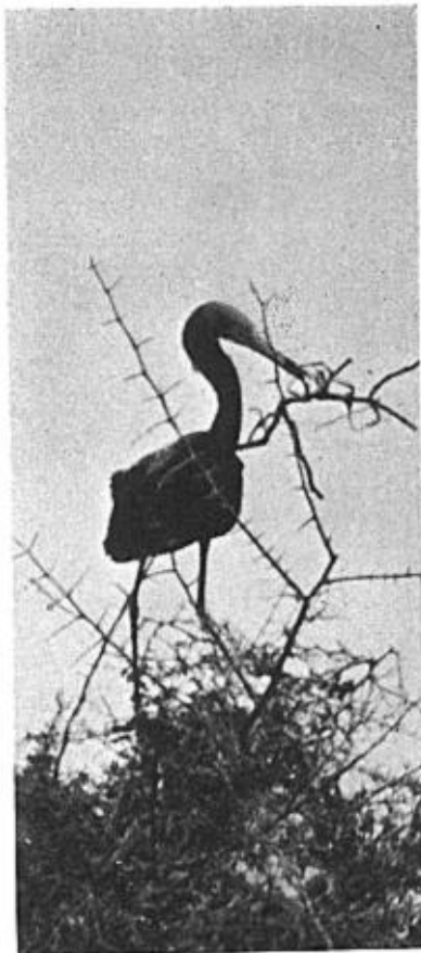
Fig. 3. REDDISH EGRET, WITH NEST MATERIAL, HAVING TROUBLE WITH THE BISBIRINDA.

In watching the Reddish Egrets many were then seen to be building nests. The greater part of the material consisted of dry salt grass stems, which was