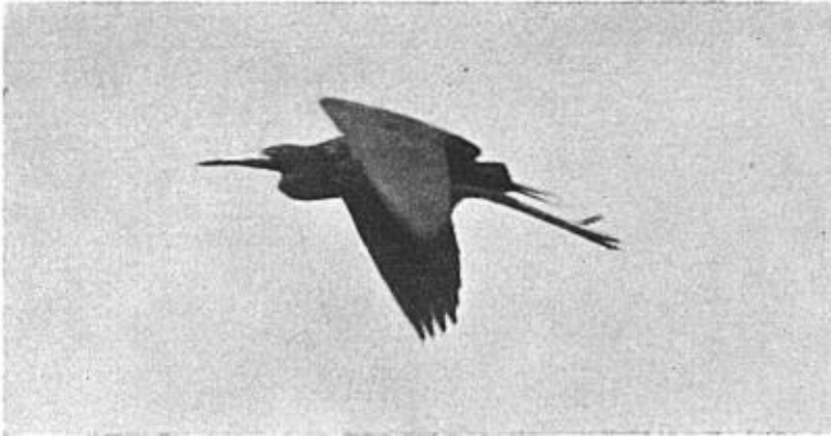
Fig. 9. THE GRACEFUL FLIGHT OF THE REDDISH EGRET.

Few land birds live on Green Island. Curve-billed Thrashers ( Toxostoma