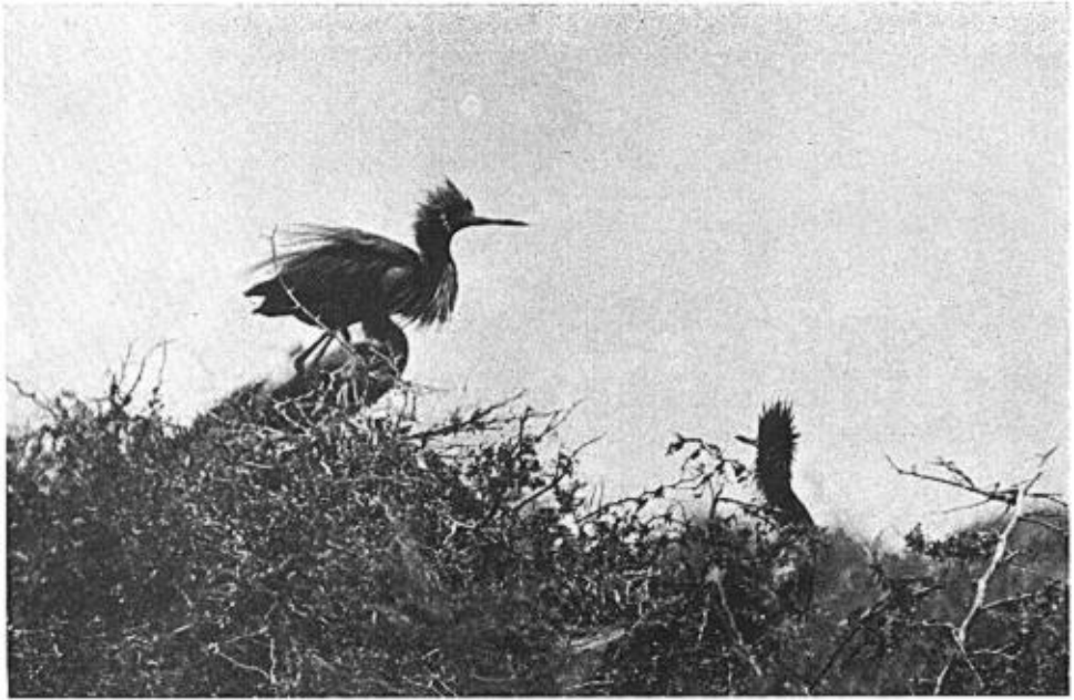
Fig. 7. THIS REDDISH EGRET HAS JUST FINISHED THE NUPTIAL DISPLAY. THE SUPPOSED FEMALE IS DIRECTLY BEHIND HIM AND THE HEAD AND NECK OF A RIVAL MALE APPEAR TO THE RIGHT.

The next day we were up early and commenced a careful examination of