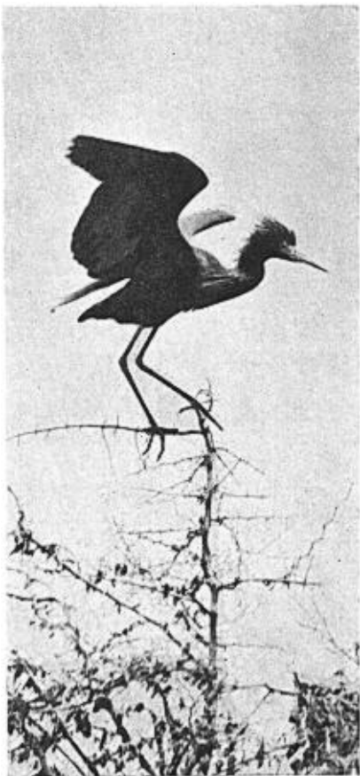
Fig. 2. THE REDDISH EGRETS HAD A LOT OF BALANCING TO DO WHEN THEY LIT ON THE BISBIRINDA, FOR THEIR FEET ARE EVIDENTLY TENDER.

After a complete circuit of the island I essayed to enter the brush and get a more intimate acquaintance with these birds. Here I got a severe surprise for it practically could not be done. The brush consisted of straggling mes-