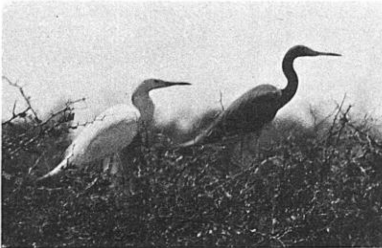
Fig. 5. A MIXED PAIR. THE REDDISH EGRET IN WHITE PHASE WAS JUDGED TO BE THE MALE, FOR IT HAD JUST GONE THROUGH THE NUPTIAL DISPLAY TO THE NORMALLY PLUMAGED BIRD. THE TWO BIRDS ARE STANDING IN A NEST.

The Reddish Egret in flight, is, I believe, more graceful than any other heron I have seen. The wing area must be larger in proportion to the size of the bird than in other herons, for there are moments when the bird handles itself after the manner of the vultures and albatrosses. Its flight is graceful, effortless and quite rapid. I found that near the end of the day the birds were entirely oblivious to man's presence. In this they resembled chickens on a roost very much. During the middle of the day they were more wary than at any other time. At any time, however, I found them to be easily frightened by the