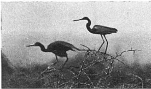
Fig. 8. LOUISIANA HERON AND REDDISH EGRET, SHOWING COMPARATIVE SIZE.

We had been in the brush only a short time when we began to notice numbers of freshly broken eggs lying in the nests. By looking for them we soon found that there was a tremendous number. They occurred in nests of all the three species which had eggs. It looked as if the birds on leaving their nests on our approach were breaking their own eggs. For some time we were perturbed at this state of affairs and determined to actually see a bird break its eggs. Birds sitting on eggs were approached, but as the bird left she never broke any eggs. Finally we discovered that it was the work of the Grackles ( Megascopus major macrourus ). Each of us separately saw these birds pounce into nests and pick holes in the eggs. In most cases the contents ran down through the nest and was wasted on the ground, but the Grackle always managed to get a few mouthfuls before the egg went dry. It looked as if a Grackle would have to break a great number of eggs before it would get a full meal. I saw Egrets drive the Grackles away from their nests frequently, so they are wise