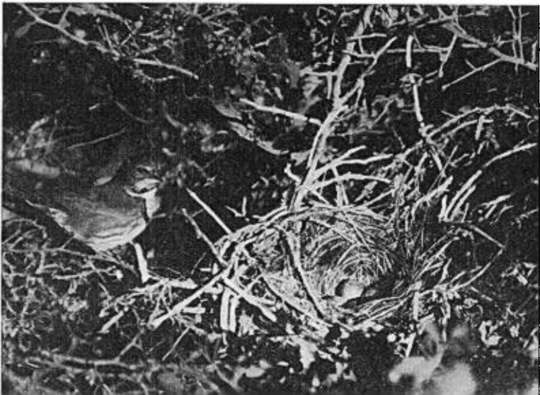
Fig. 16. STEPHENS FOX SPARROW APPROACHING NEST; BIG BEAR LAKE, SAN BERNARDINO MOUNTAINS.

On the afternoon of May 31 we started to prospect carefully through a likely looking patch of mountain misery, oftentimes called buckthorn, near the lake shore; and to prospect means to examine every bush carefully. Stephens Fox Sparrows and Green-tailed Towhees were singing, Wright Flycatchers twitter-