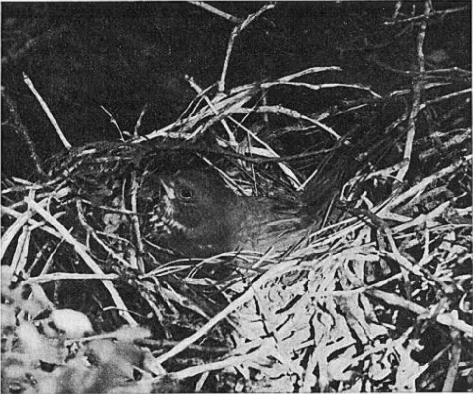
Fig. 17. STEPHENS FOX SPARROW ON NEST; BIG BEAR LAKE, SAN BERNARDINO MOUNTAINS.

The eggs of this first set measure in millimeters as follows: 21.5x16.5, 21.6x16.5, and 21.x16.5. These eggs are very nearly equal ended, with a pale glaucous blue ground color, and they are boldly marked. One is rather heavily spotted and blotched with cameo brown and vinaceous russet, the darker spots being chocolate color. There are distinct under tints of plumbago gray, making it one of the most beautiful eggs of this species that I have ever seen. The markings are about evenly distributed over the whole egg. The second egg is spotted and only slightly blotched or flecked with cameo brown and vinaceous russet. The